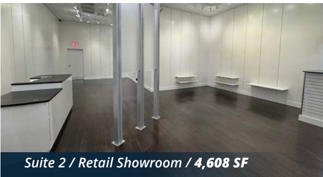
Suite 2 / Retail Showroom / 4,608 SF