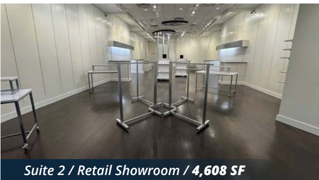
Suite 2 / Retail Showroom / 4,608 SF