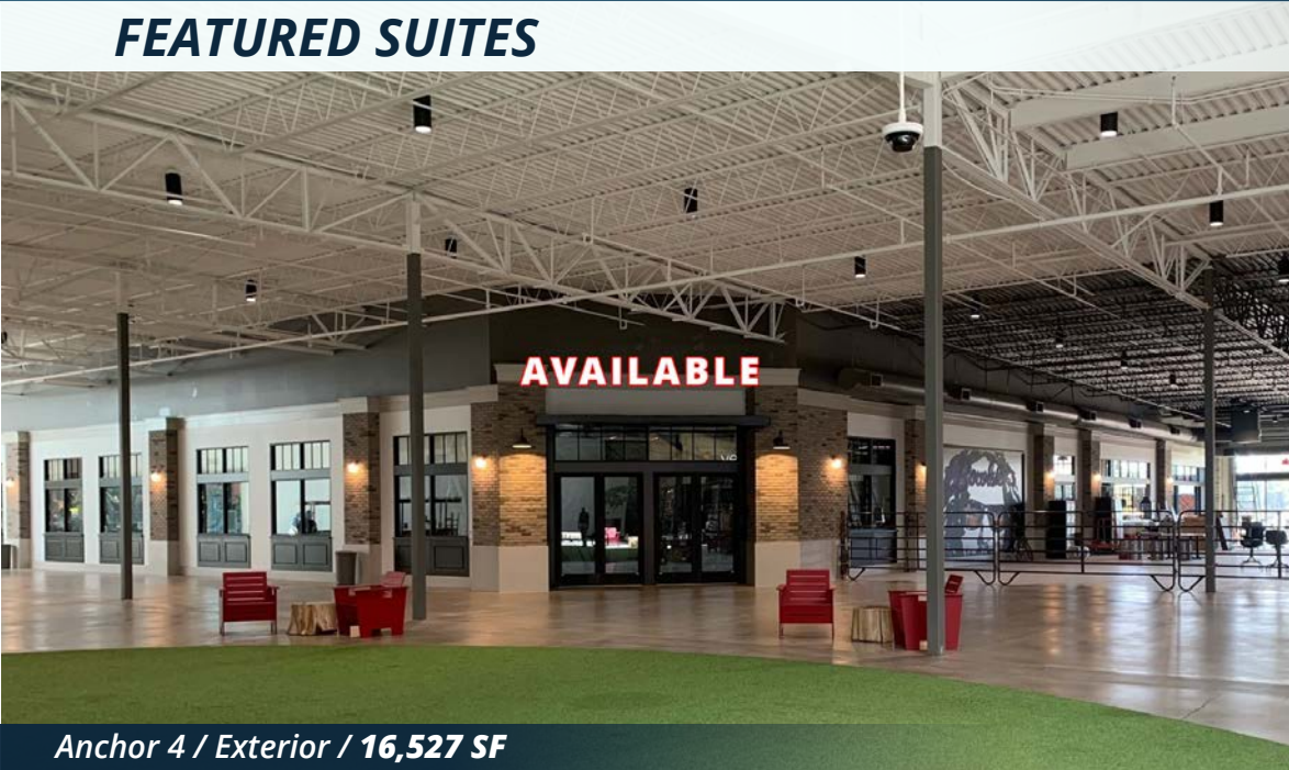
Anchor 4 / Exterior / 16,527 SF