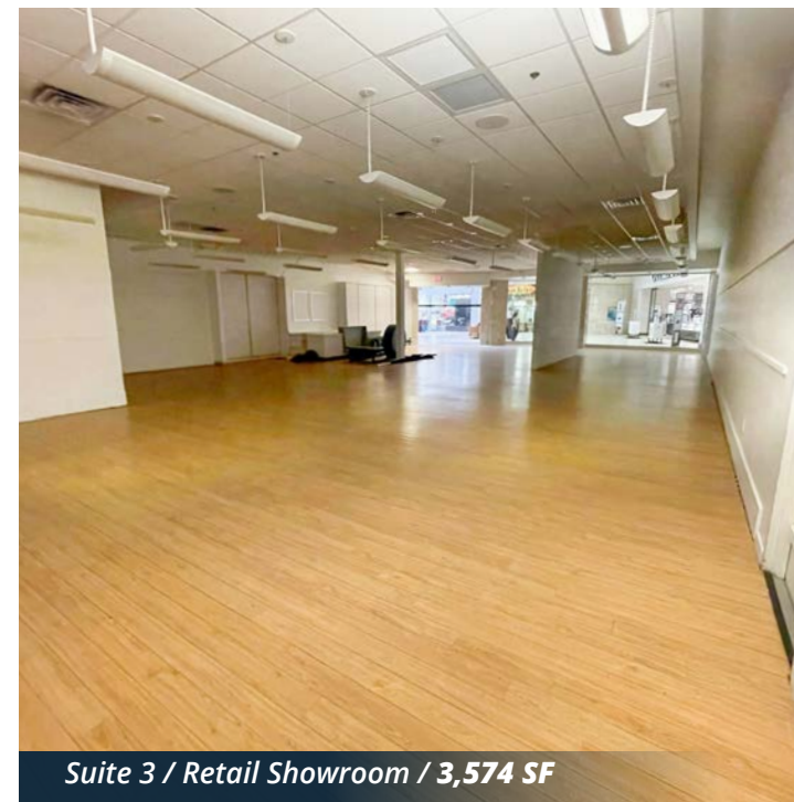
Suite 3 / Retail Showroom / 3,574 SF