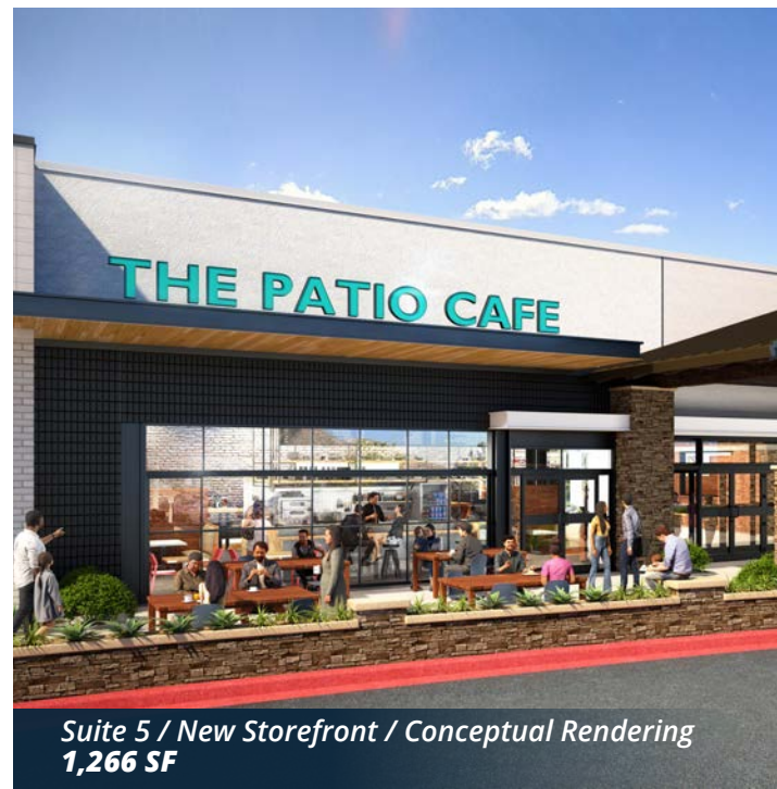
Suite 5 / New Storefront / Conceptual Rendering 1,266 SF