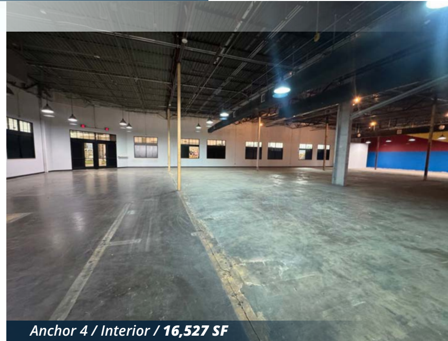
Anchor 4 / Interior / 16,527 SF