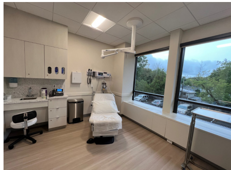
MEDICAL PROCEDURE ROOM