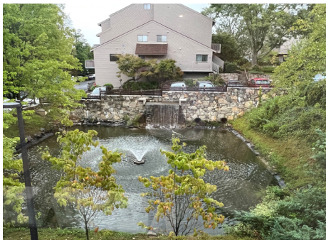
ON-SITE PARK-LIKE SETTING