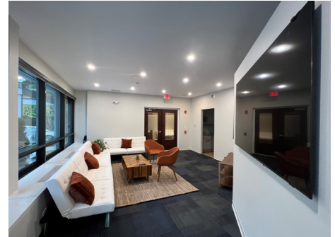
CURRENT TENANT RECEPTION