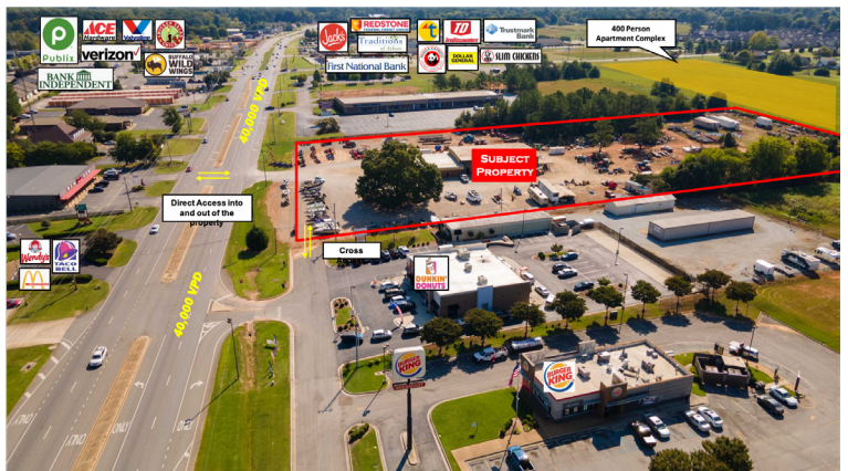
*image showing pre-landlord site work