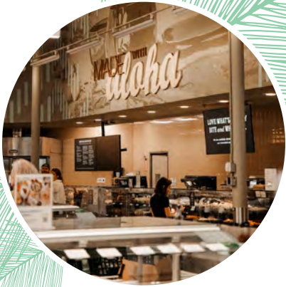
MAUI'S ONLY WHOLE FOODS MARKET