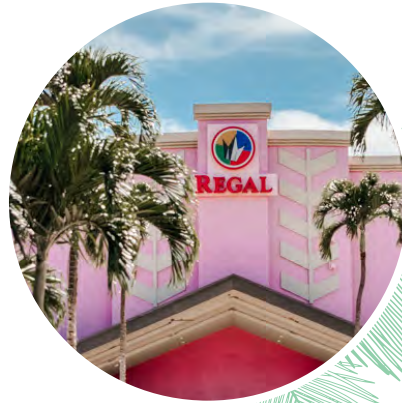
MAUI'S LARGEST MOVIE THEATER WITH STADIUM SEATING