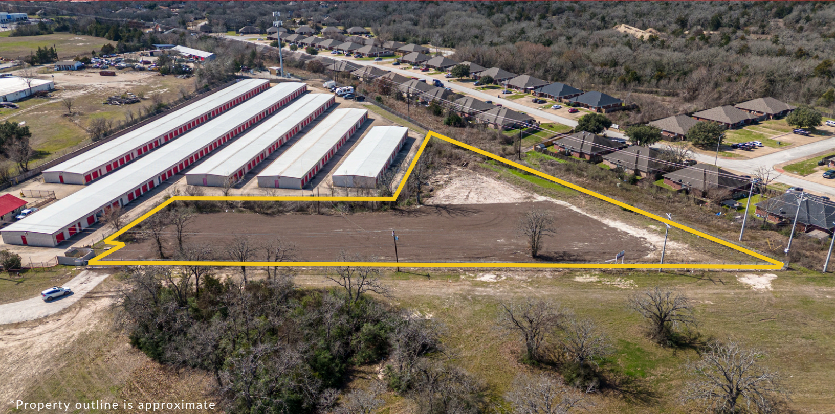
*Property outline is approximate