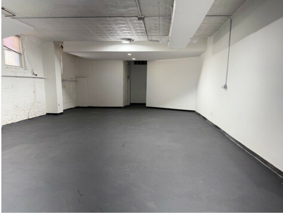
Rear area towards back of space