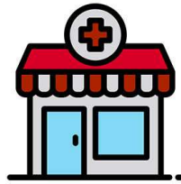
Medical or Dental