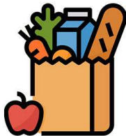
Grocery or Convenience