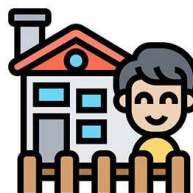
Child Care Center