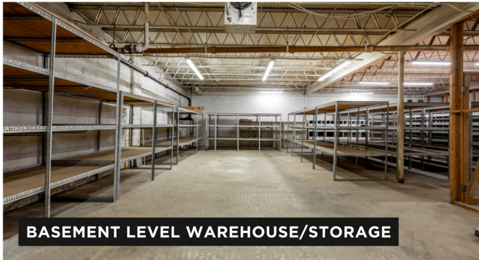
BASEMENT LEVEL WAREHOUSE/STORAGE