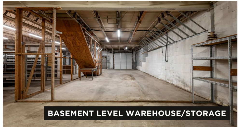
BASEMENT LEVEL WAREHOUSE/STORAGE