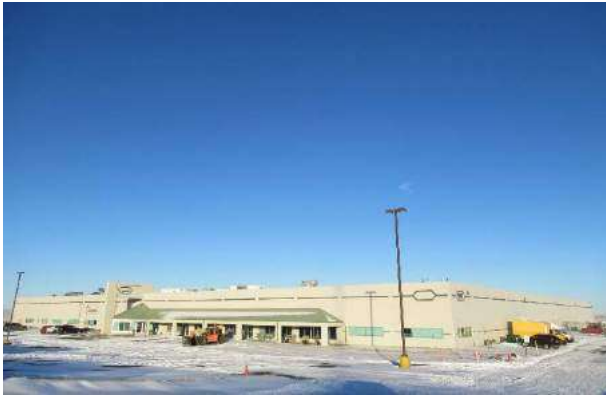
SOUTHWESTERN BUILDING ELEVATION (BUILDING 65)