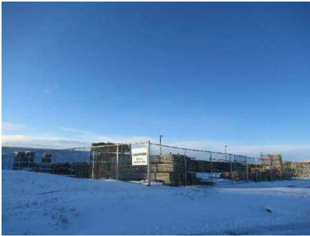
OUTDOOR STORAGE AREA TWO