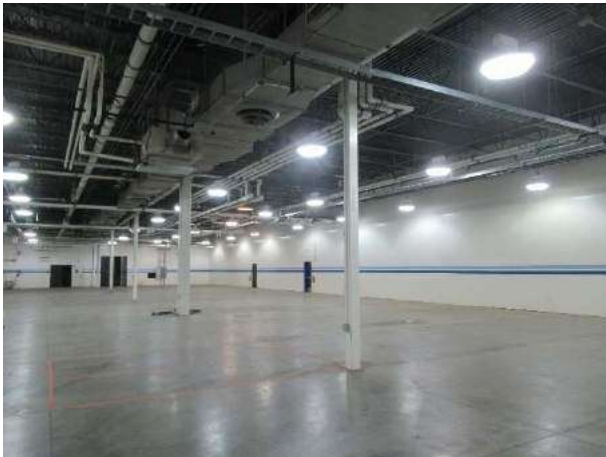
BUILDING 65, SUITE WH-D