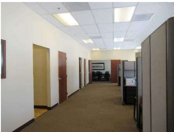
BUILDING 65, SUITE B