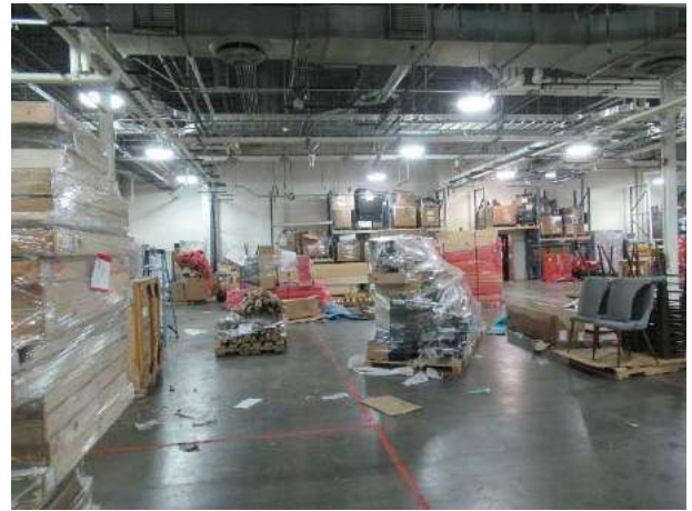
BUILDING 65, SUITE WH-A-B