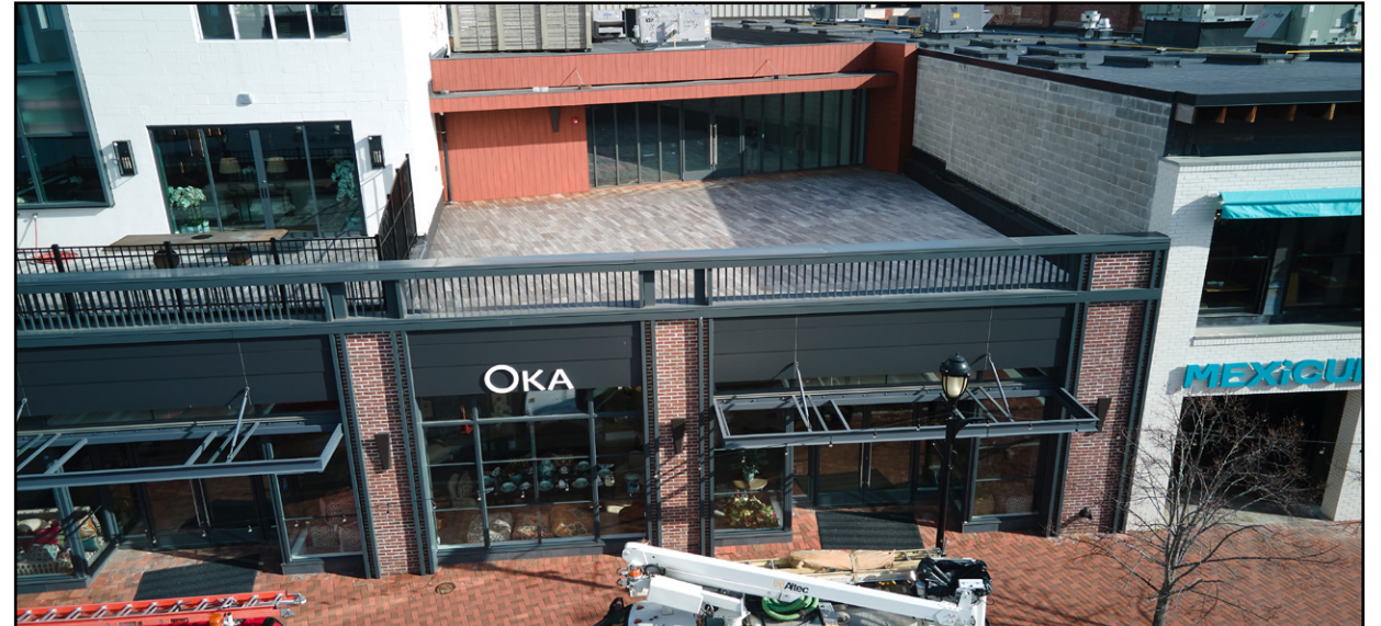
PRIVATE ROOF DECK FROM