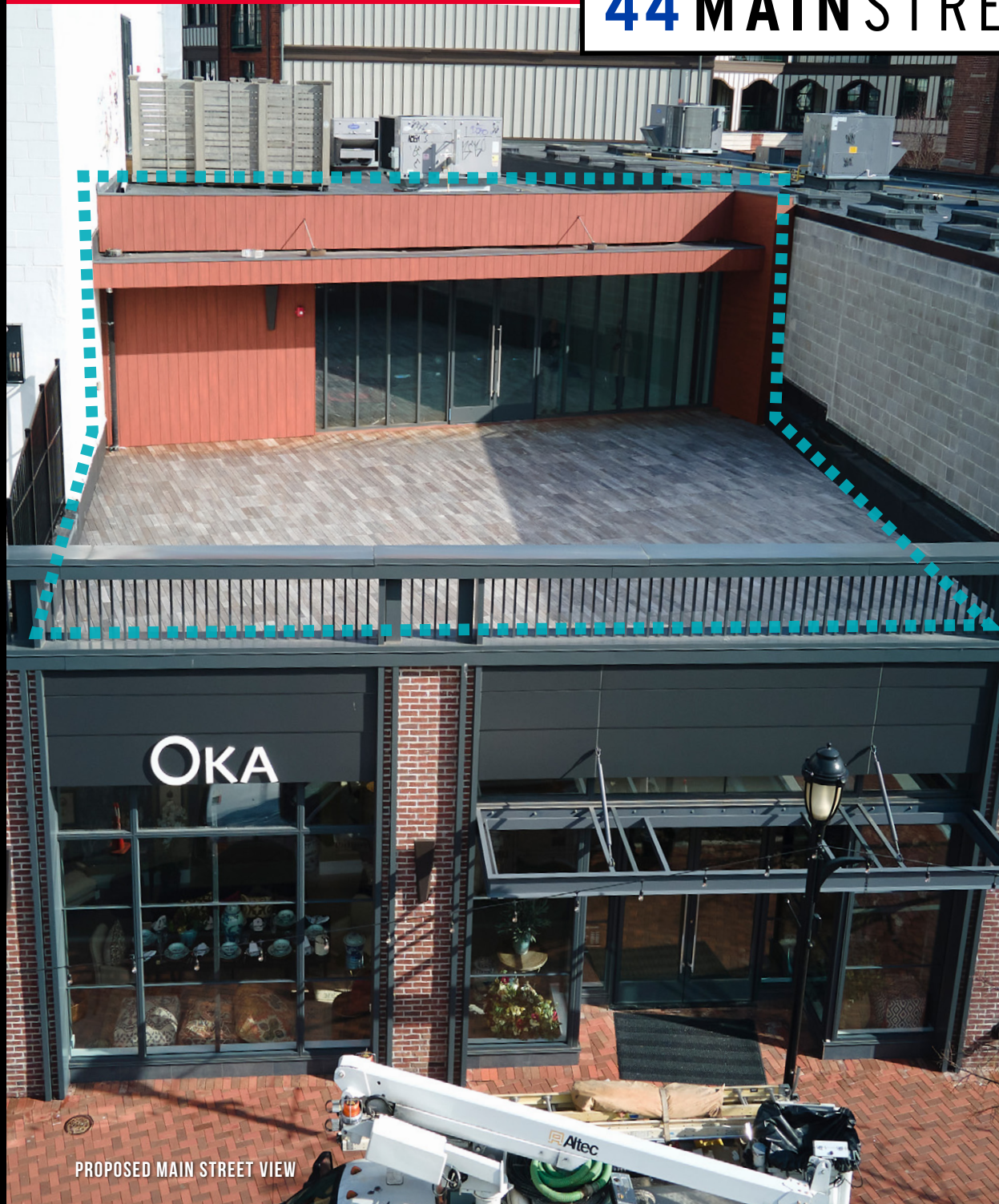
PROPOSED MAIN STREET VIEW