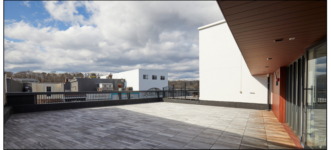
PRIVATE ROOF DECK