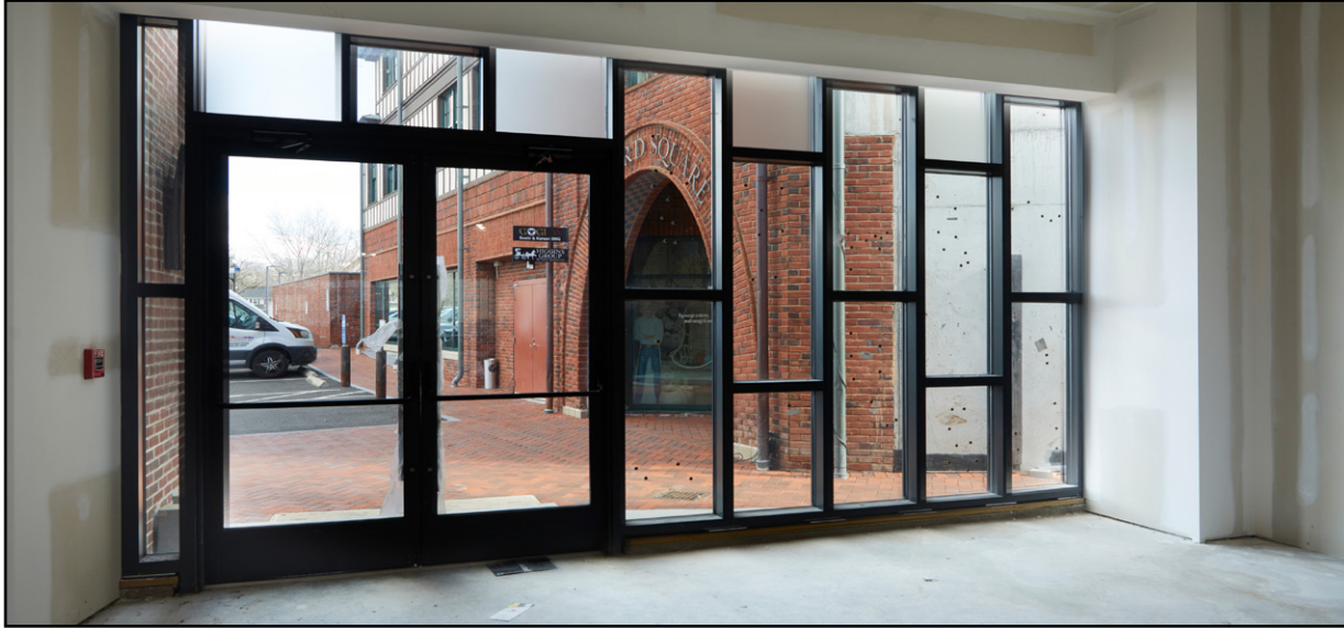
INTERIOR OF ENTRANCE