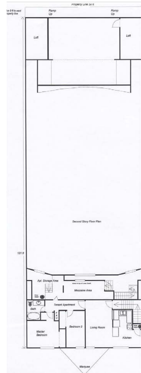
2ND FLOOR - 1,938 SF