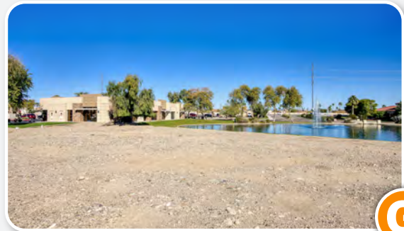
Building Lot G: +/- 9,317SF