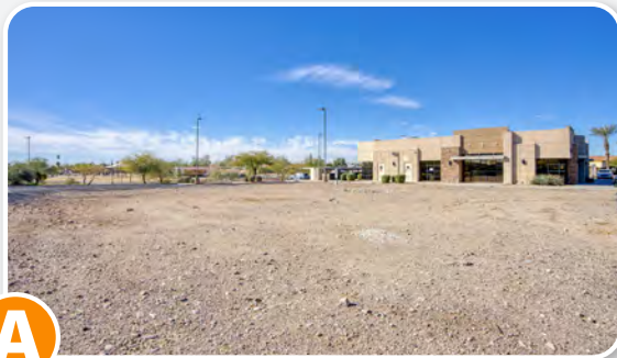
Building Lot A: +/- 6,359SF