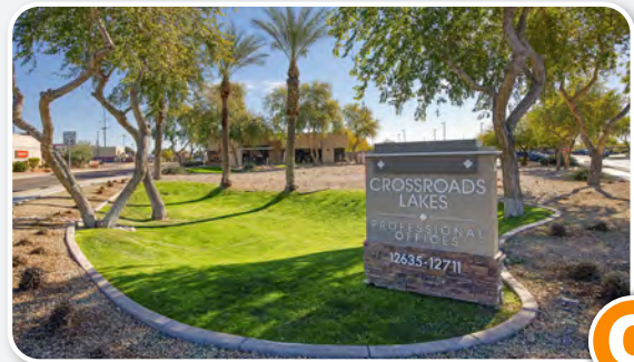
Building Lot C: +/- 6,359SF