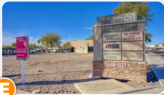
Building Lot E: +/- 6,359SF