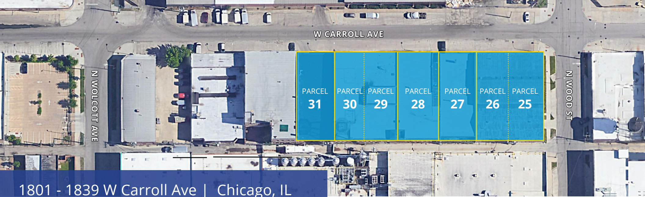
1801 - 1839 W Carroll Ave | Chicago, IL

Colliers is pleased to present a one-of-a-kind opportunity to purchase a 5-building assemblage in one of Chicago’s hottest submarkets.