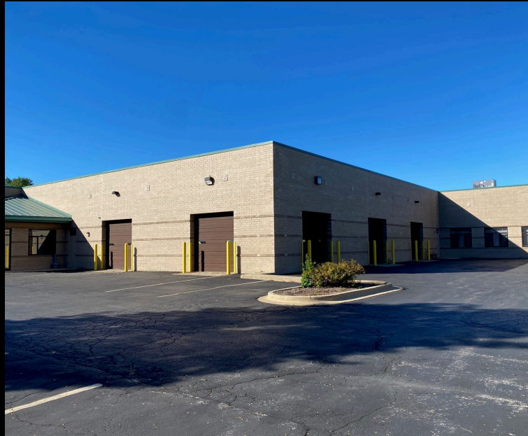
Five 10' Drive in Doors