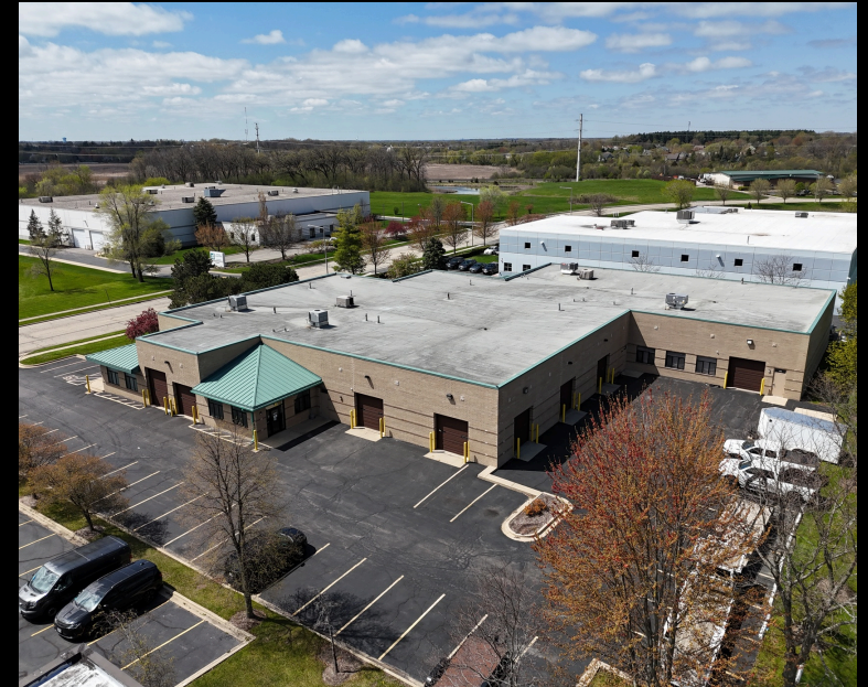
First Come, First Serve Basis Parking (2.2 parking ratio)