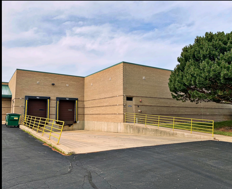
Two 10' Shared Dock Height Doors