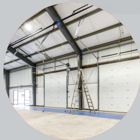
TWO 12'x14' MORTISED DOORS