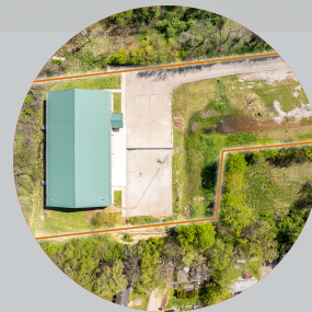
2.86 ACRES PARKING & STORAGE