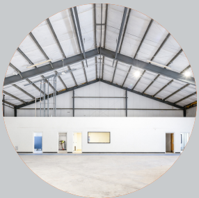
CLEAR-SPAN WITH 24' PEAK HEIGHT