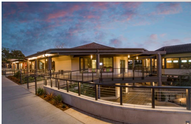
Coast Village Plaza