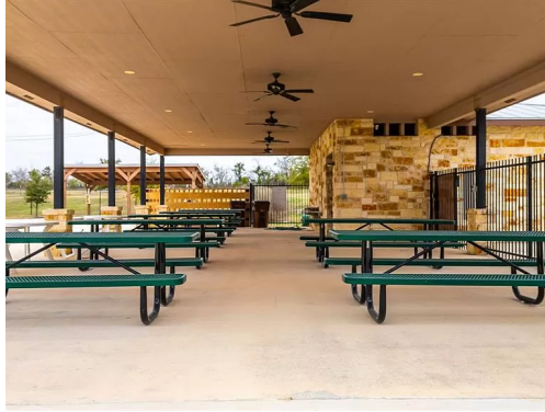
Community pool, Cabana & Restrooms