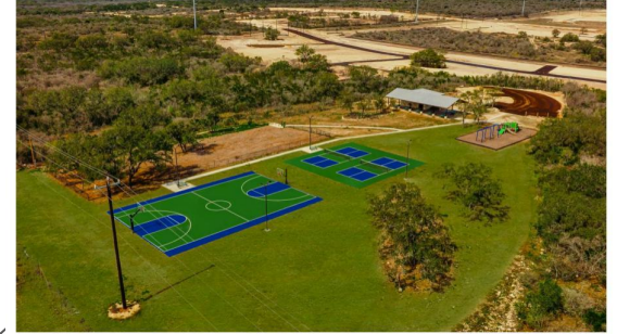
Basketball Court, 2 Pickleball Courts, Playground, Dog Park, Covered Pavilion w/ Picnic Tables and Restrooms