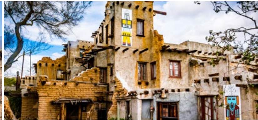
Cabot's Pueblo Museum Nearby