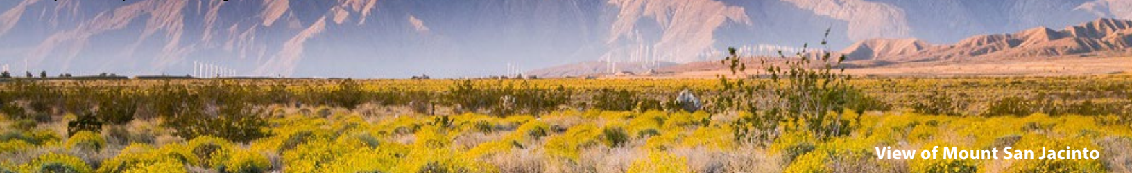
View of Mount San Jacinto