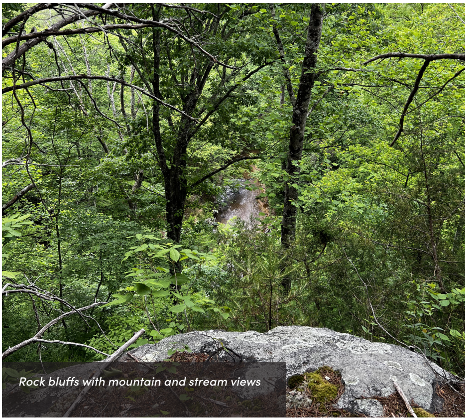
Rock bluffs with mountain and stream views