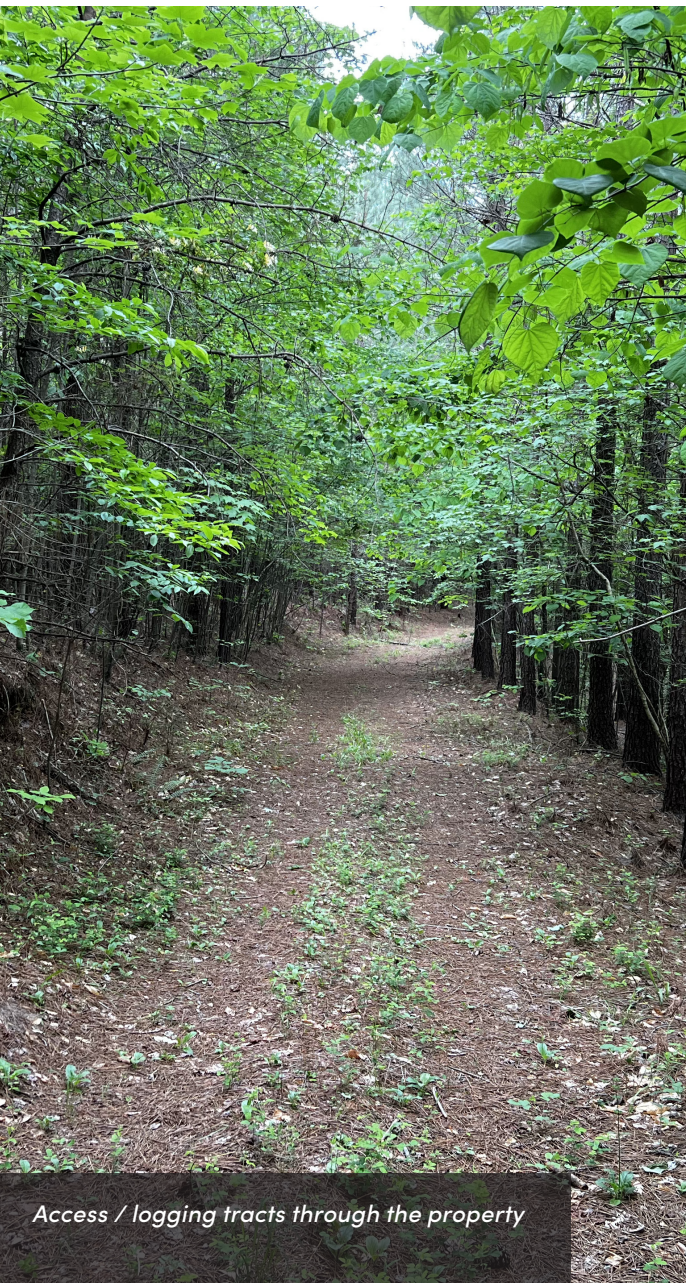
Access / logging tracts through the property