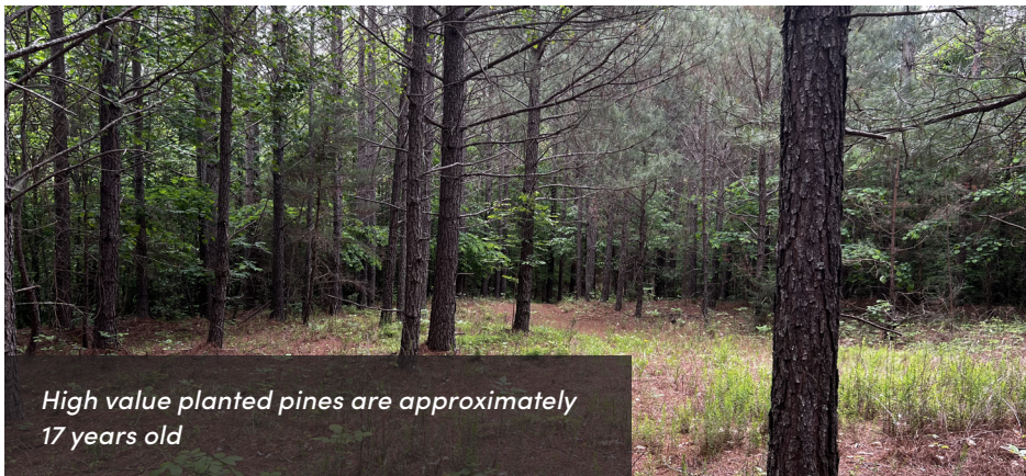
High value planted pines are approximately 17 years old