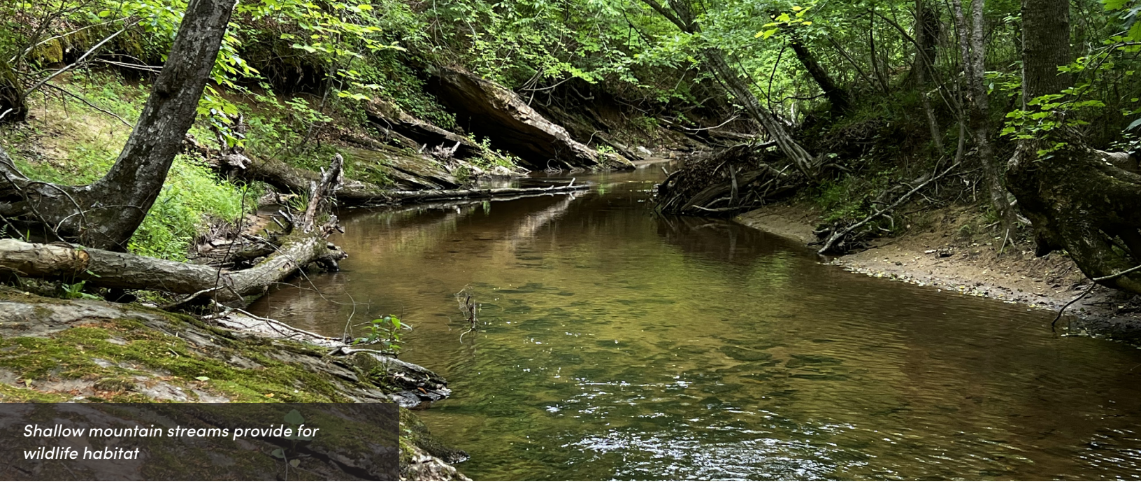
Shallow mountain streams provide for wildlife habitat