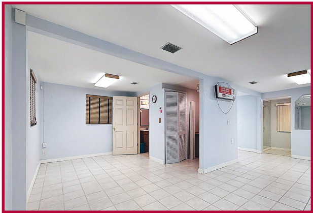
Former Hair Salon