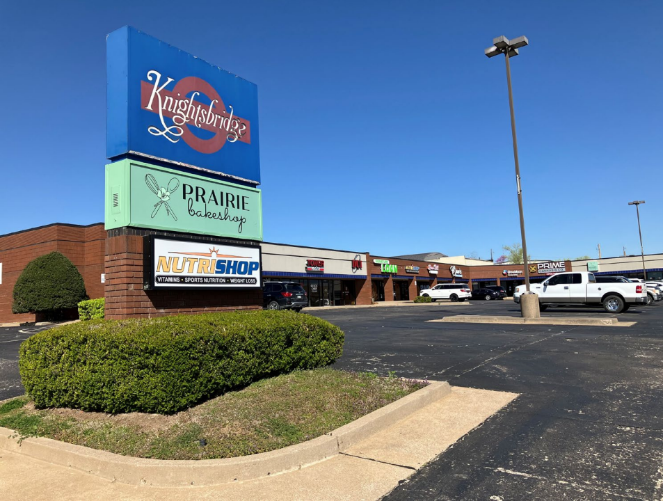
Northwest Corner 76 th Street North & US 169 Owasso, OK