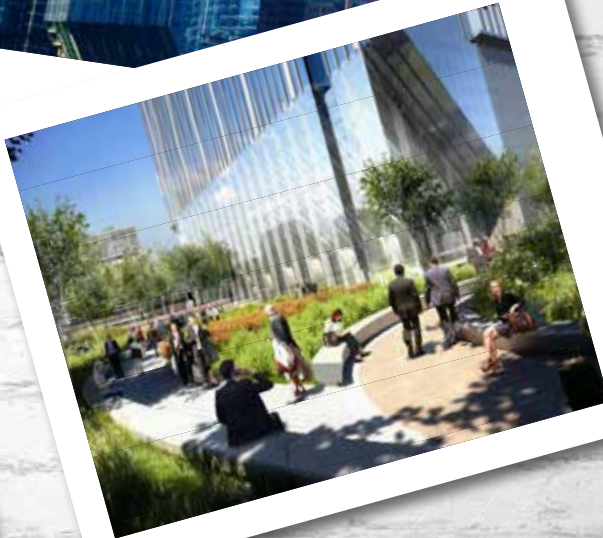
111 NORTH CANAL 860K SF