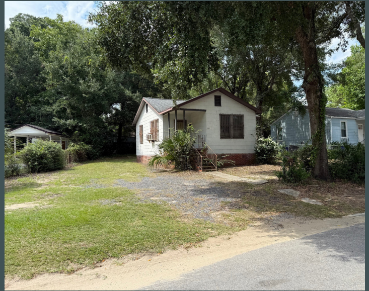
2308 Bailey Dr