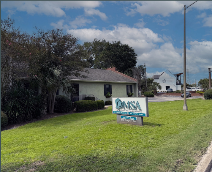
2320 Cosgrove Avenue