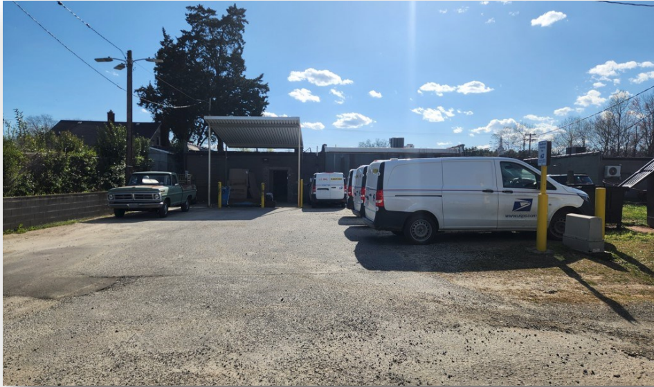
Additional Parking behind Strip Center