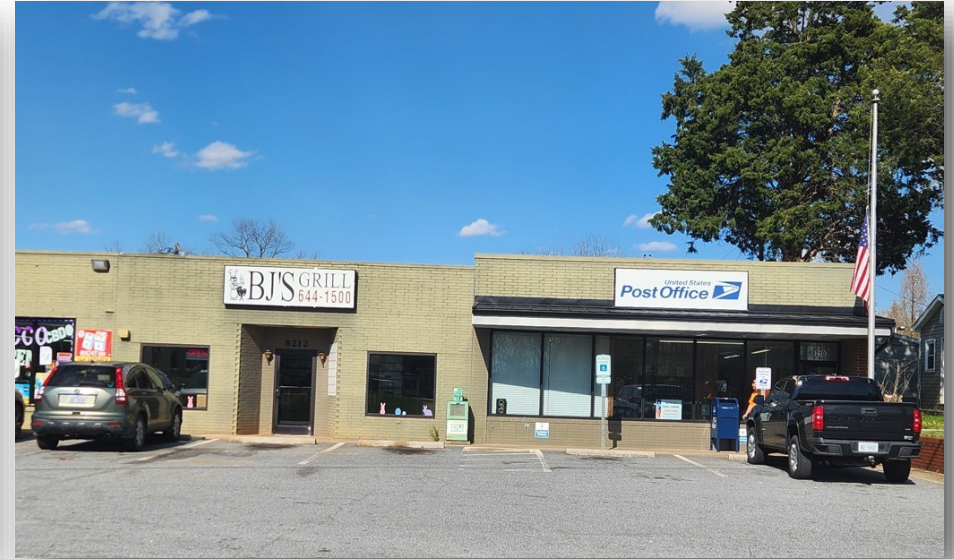
Five tenant retail shops