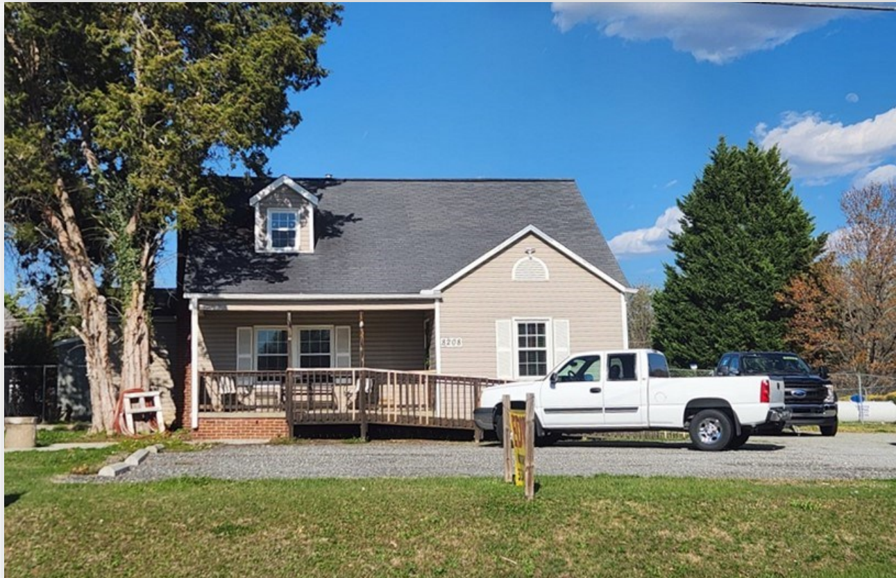
Free standing retail building included in sale