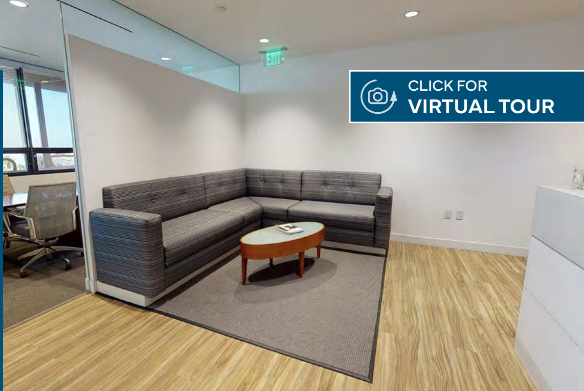
VIEW FROM THE SUITE