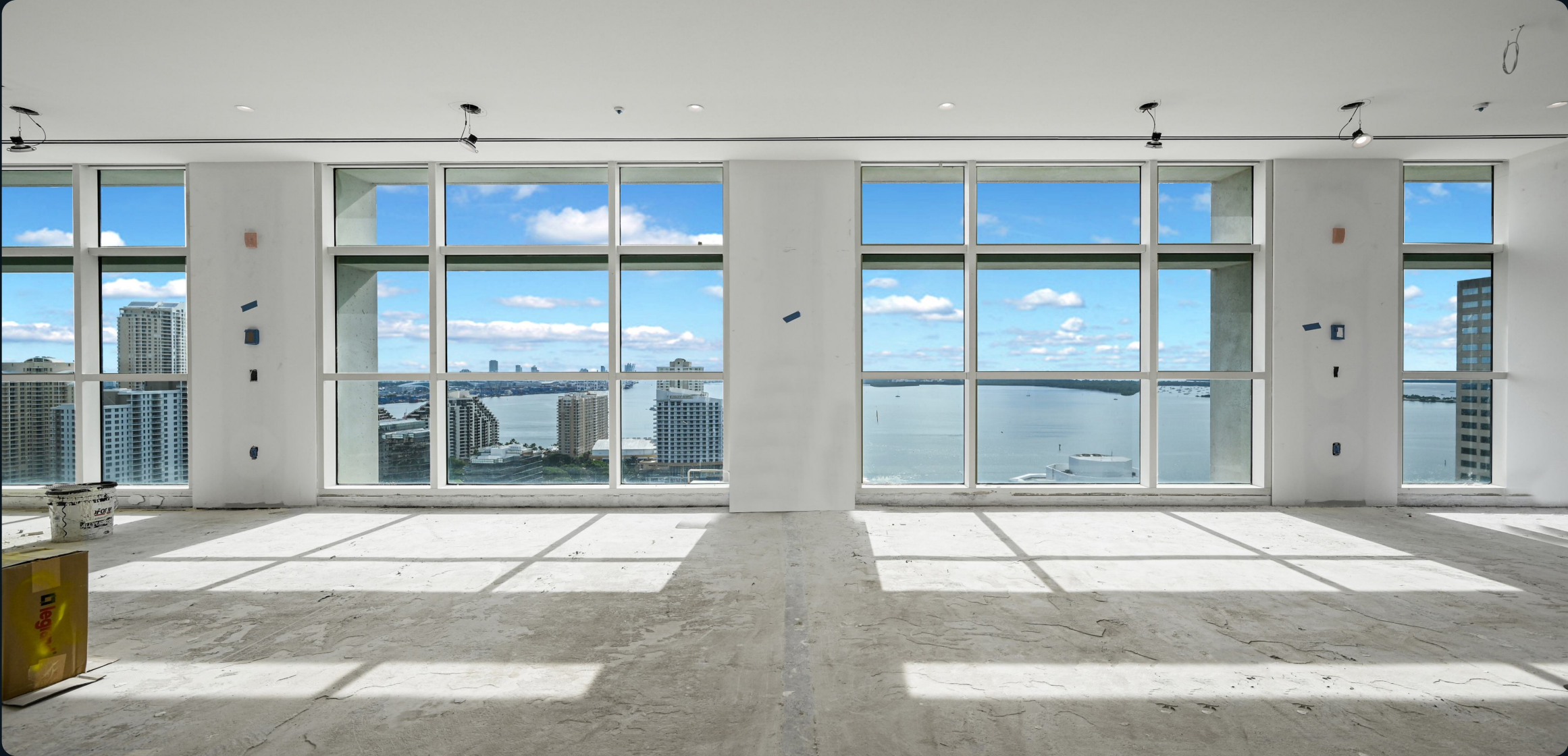
801 Brickell Ave, Entire 22nd Floor