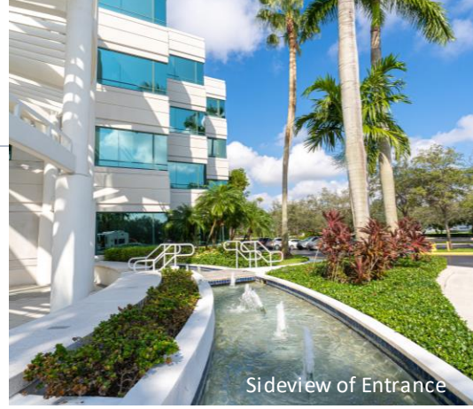
Sideview of Entrance