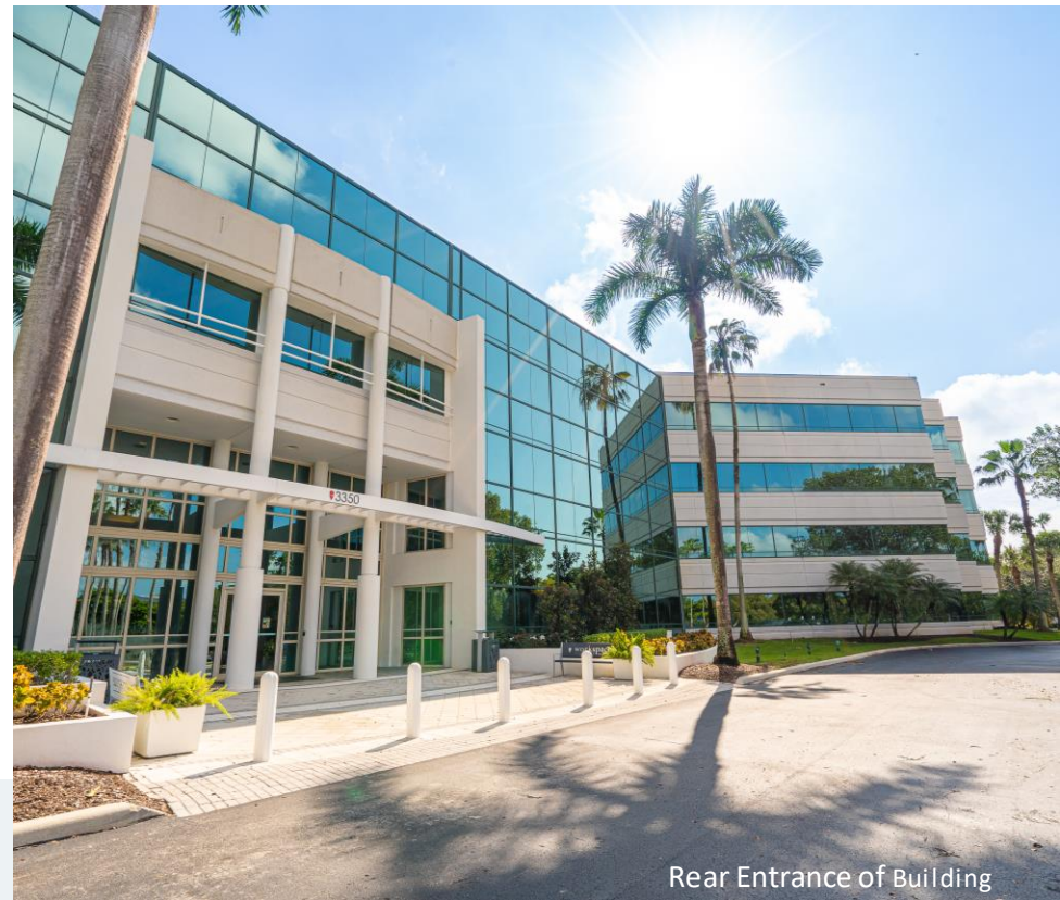
Rear Entrance of Building