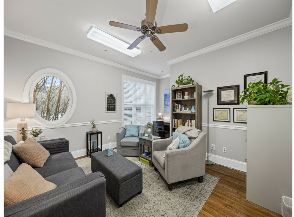
Office 2 of 4