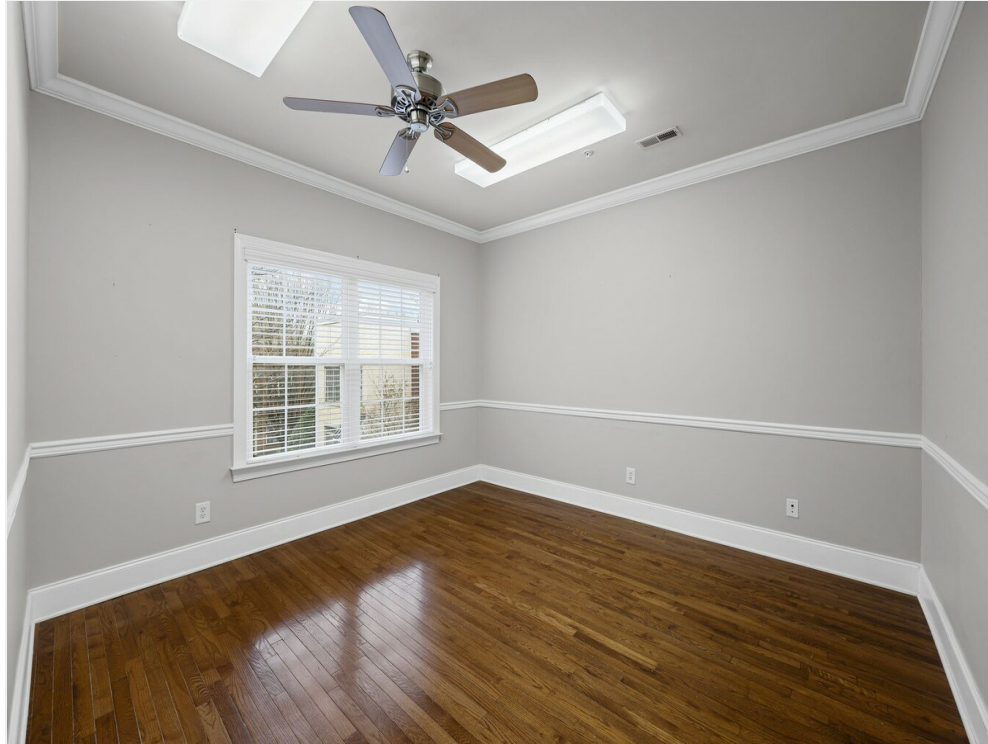
Office 3 of 4