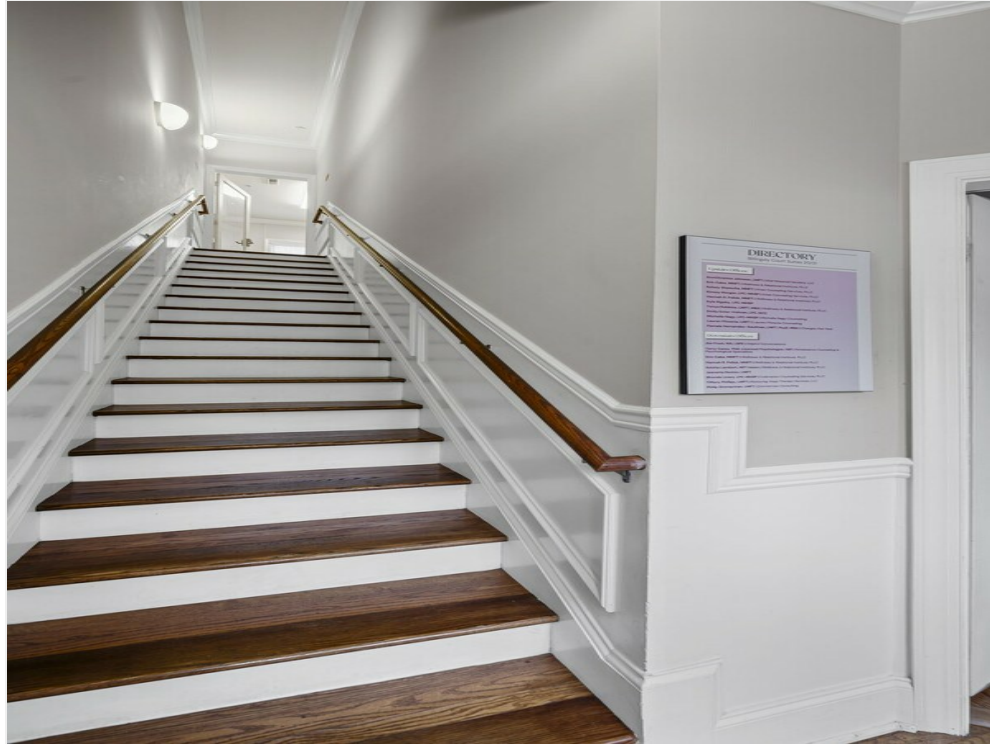
Stairs from Shared Entrance