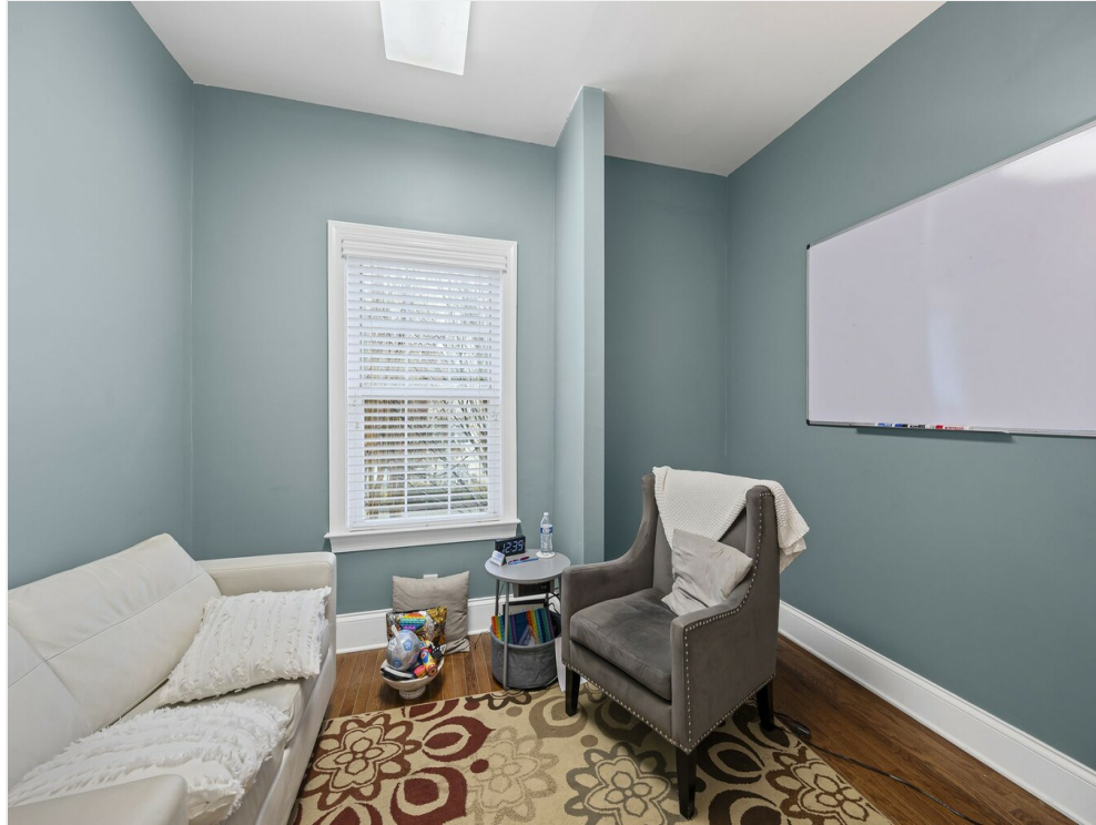
Office 1 of 4