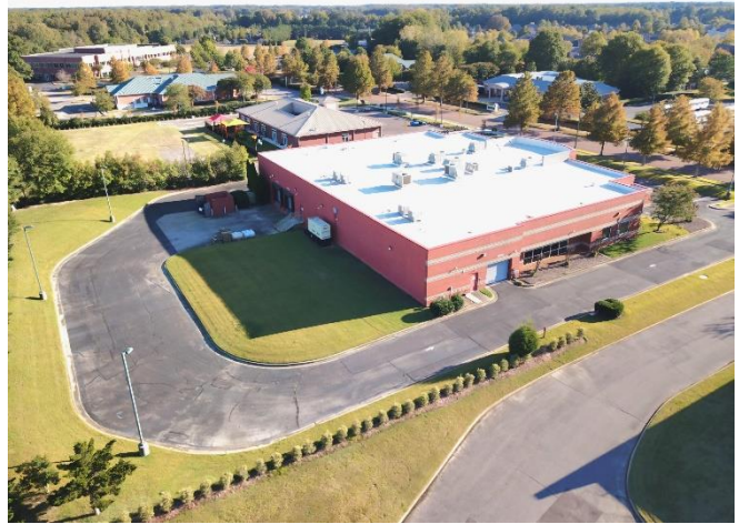
100 Crescent Drive, Collierville TN 38017