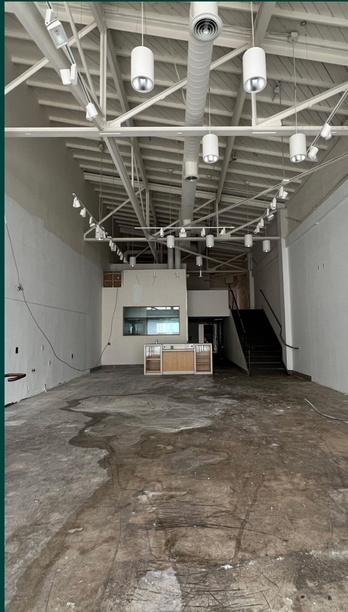
▲ GROUND FLOOR