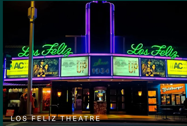
LOS FELIZ THEATRE