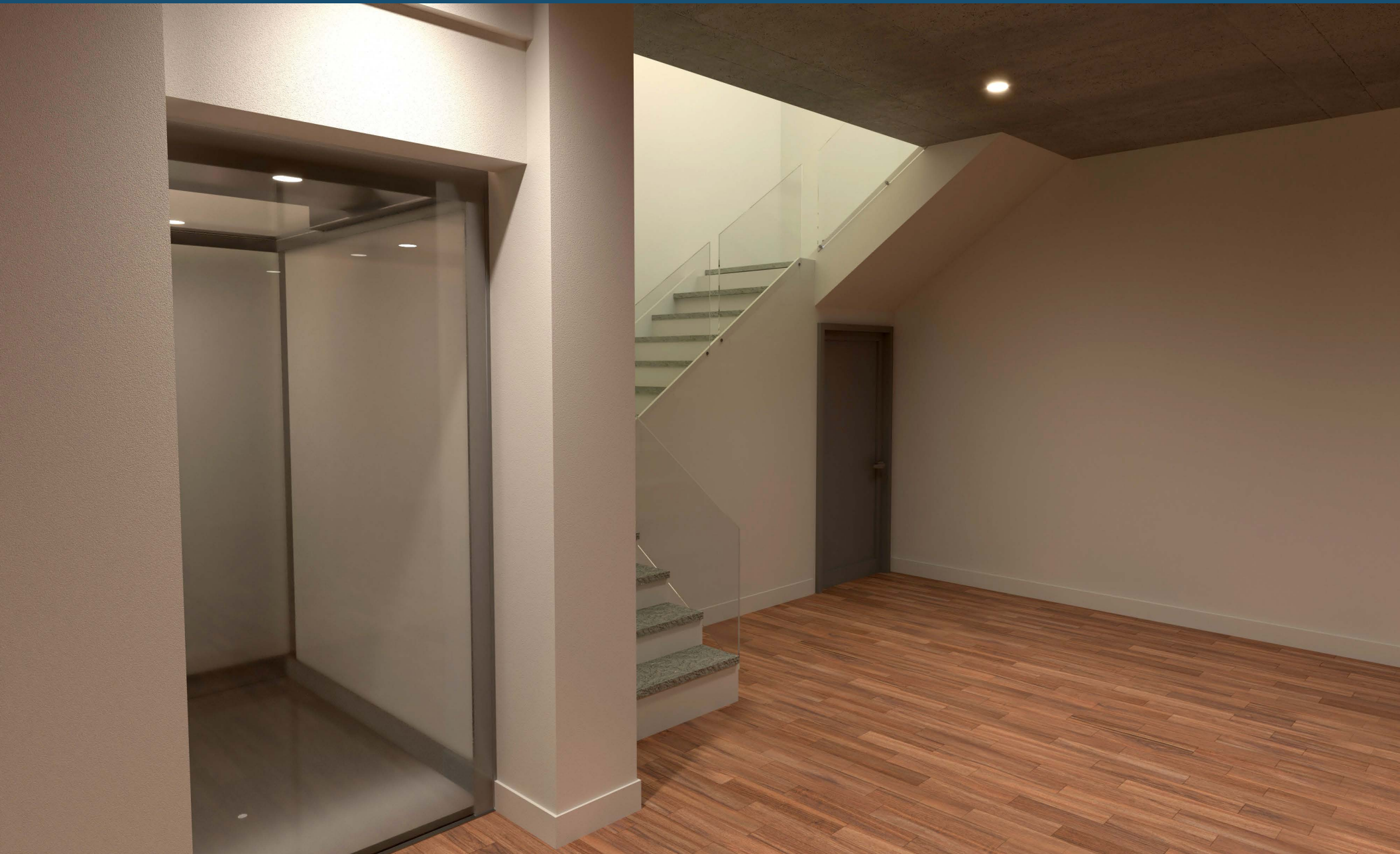
LOWER LEVEL STAIRWAY AND ELEVATOR ACCESS