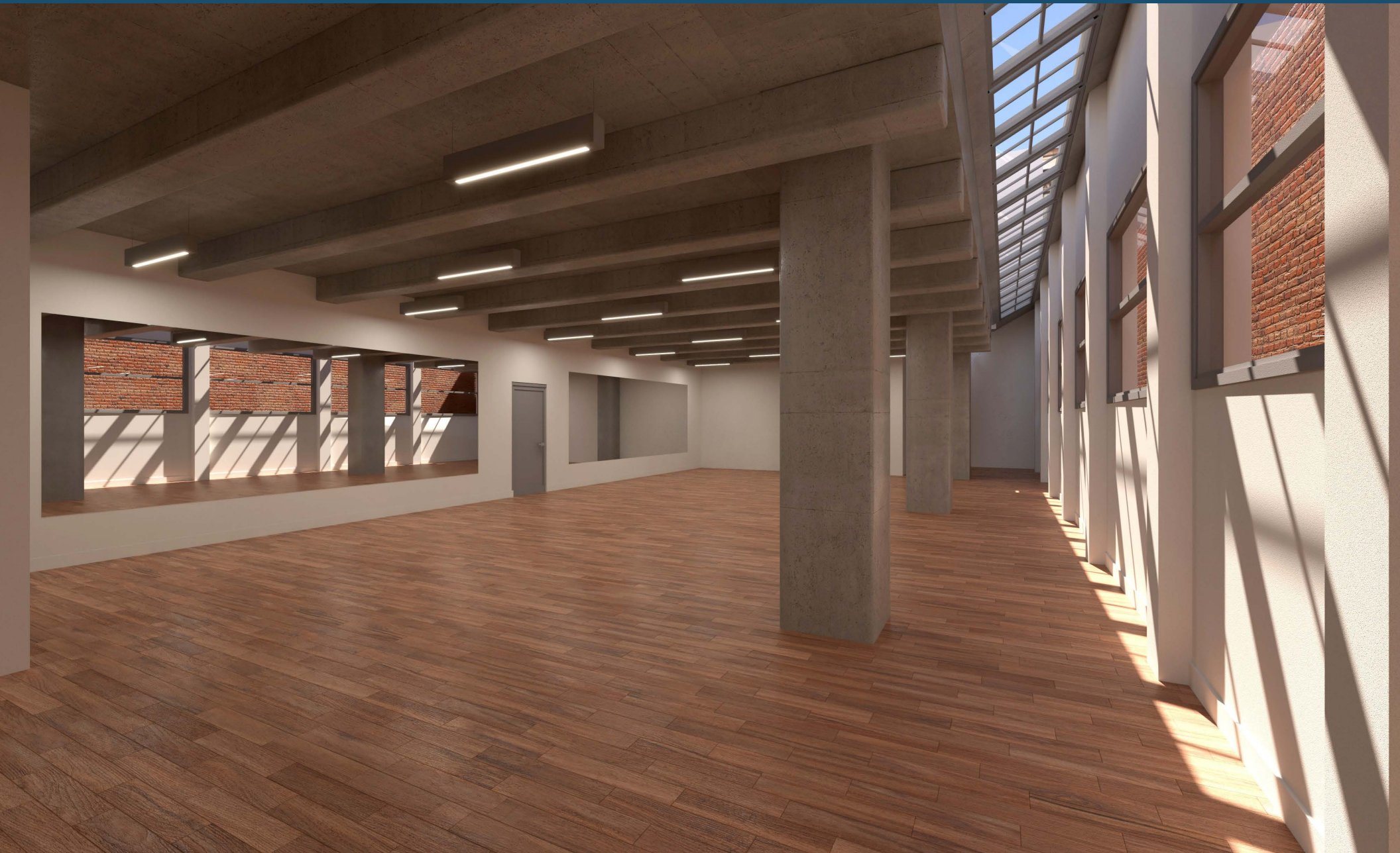
LOWER LEVEL SPACE