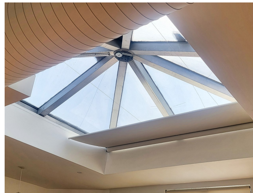
SKYLIGHT WITHIN SPACE FOR BEAUTIFUL NATURAL LIGHT