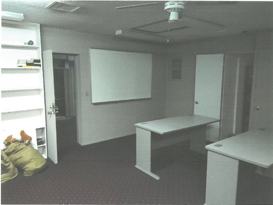
5107 14 TH STREET WEST BRADENTON, FL 34207