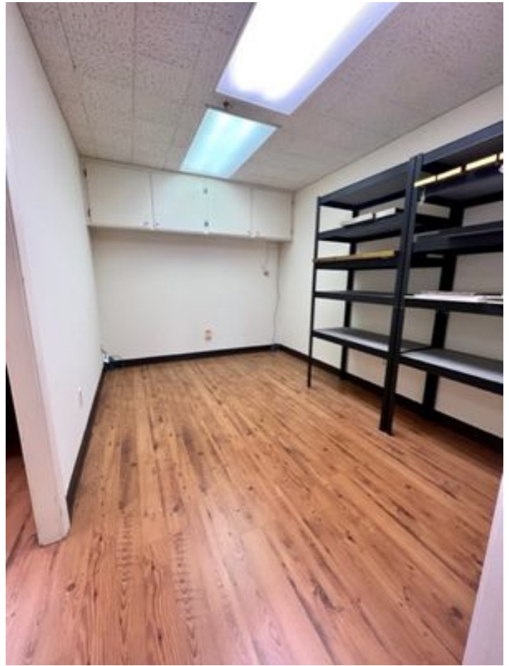
Private Office Space