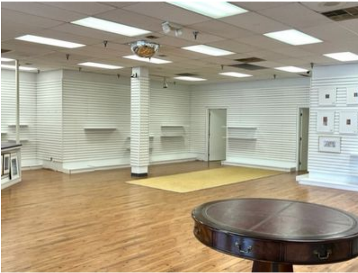
Open Sales Floor