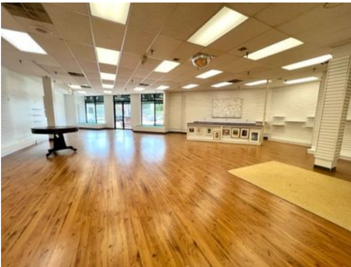
View to Front