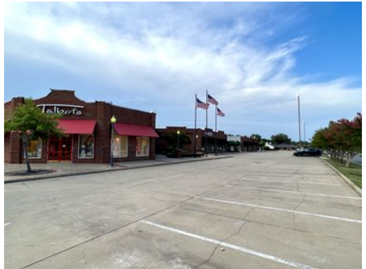
New Roof - July, 2022!