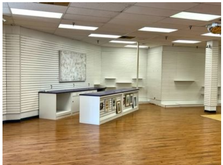
Slatwall Panel System with Accessories