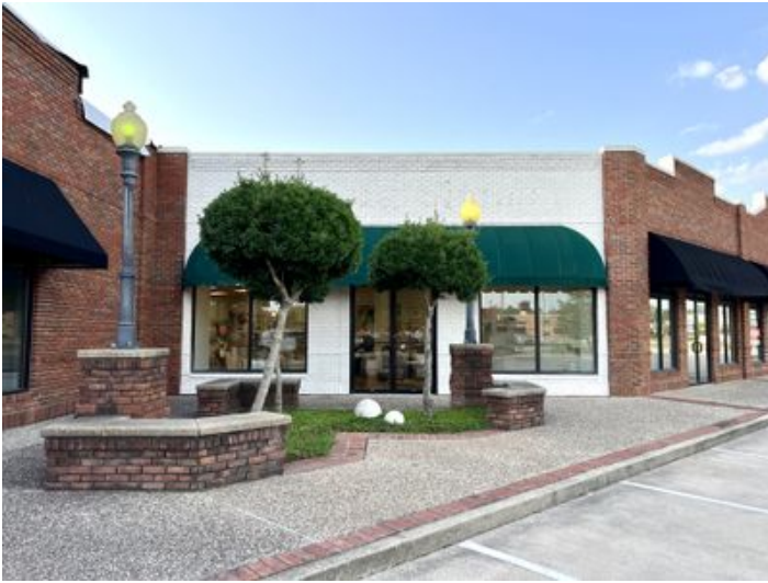
2,478 SF Retail Space