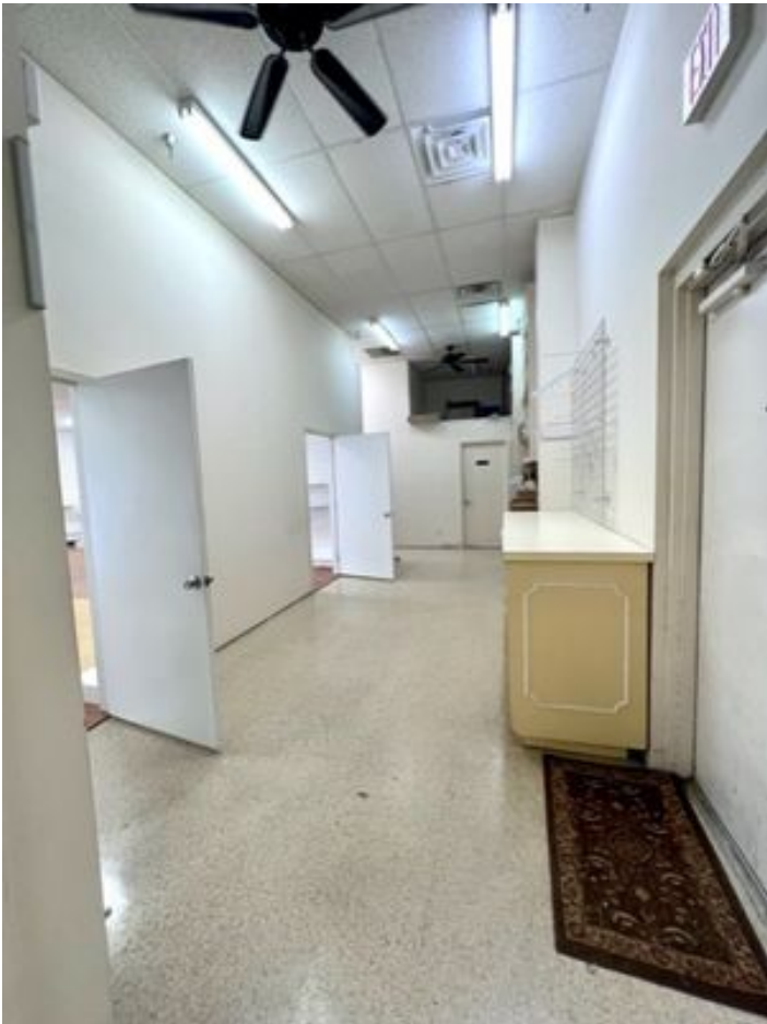
Galley Stock Area