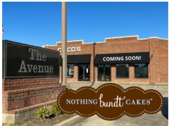
Nothing Bundt Cakes - Now Open!