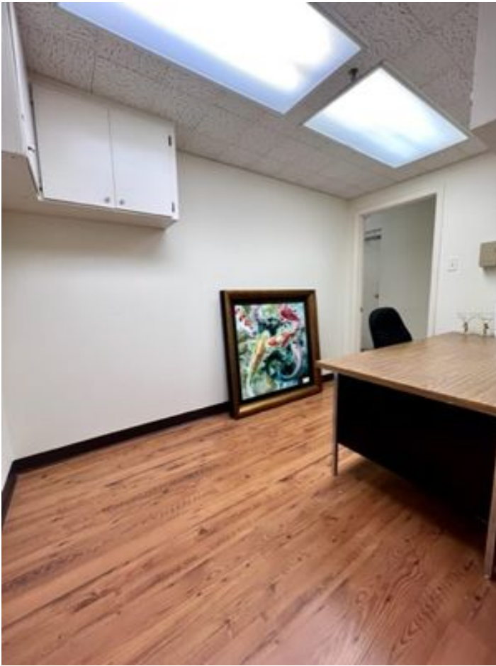
Private Office Space