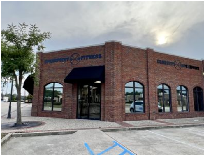
The Salad Station - Summer 2023!