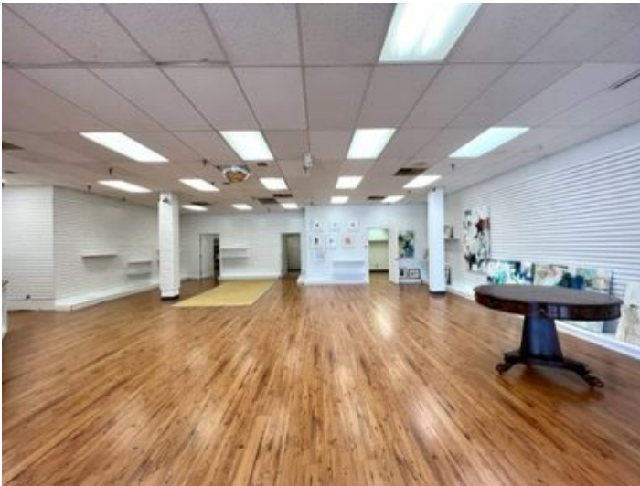
Vinyl Tile Floor System