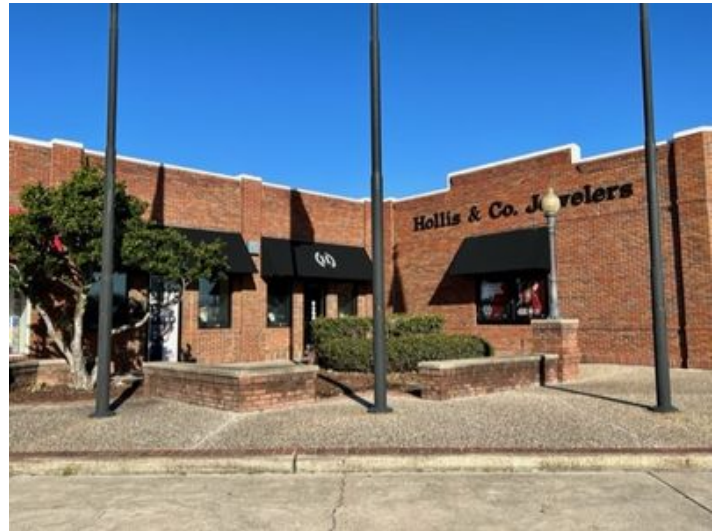
Hollis & Co. Jewelers