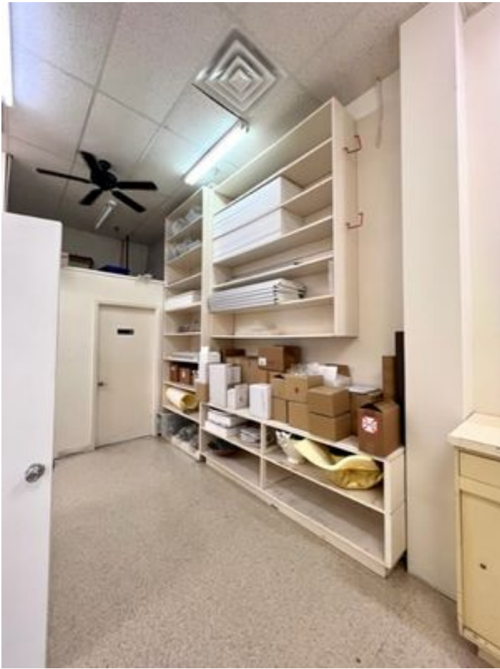
Stock Room Corridor/Restroom