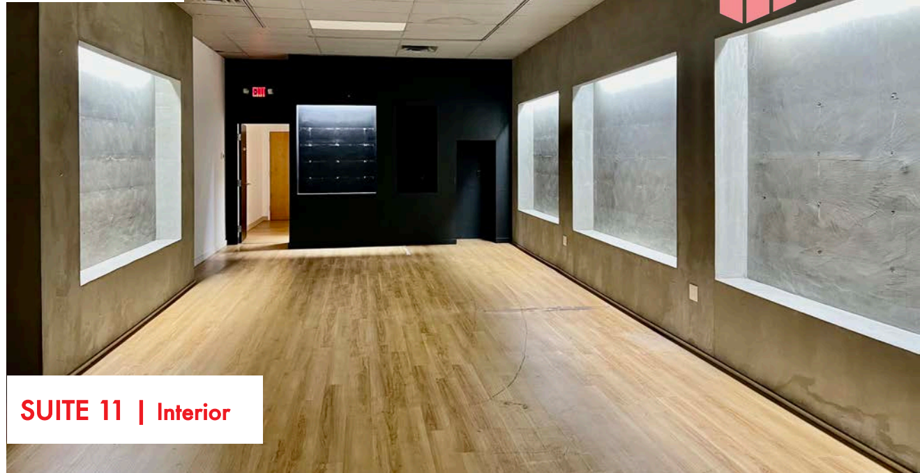
SUITE 11 | Interior

Howard Commons Plaza is located at a heavily traveled intersection that contains many high profile national and local tenants. There is a signalized intersection to and out of the center. Easy access to 390/490. Some of the major retailers nearby are Aldi Supermarket, Wegmans, Verizon, McDonald's, Taco Bell, Little Caesar's etc. Four available units from 1,733 SF to 3,500 SF. Please call for leasing rates.