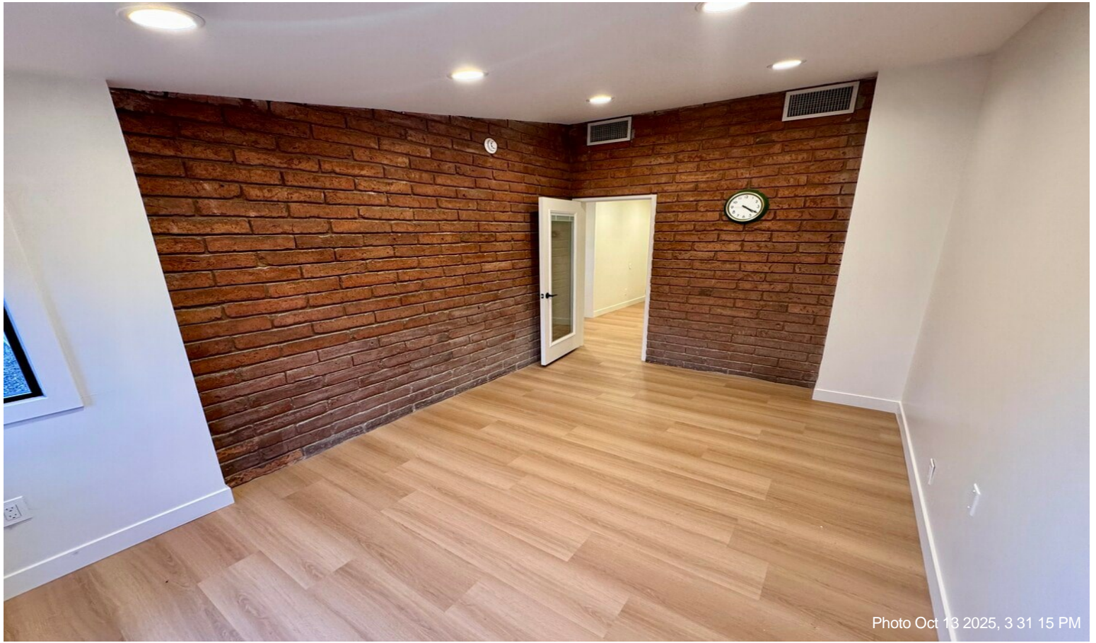
Photo Oct 13 2025, 3 31 15 PM