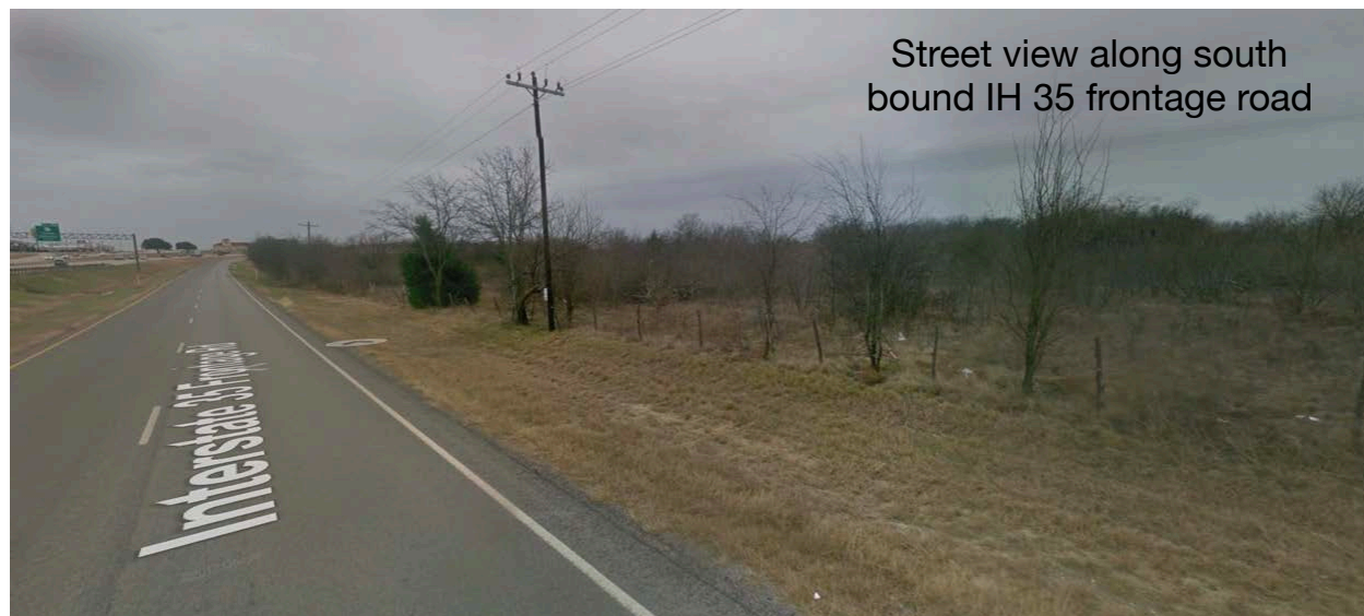
Street view along south bound IH 35 frontage road