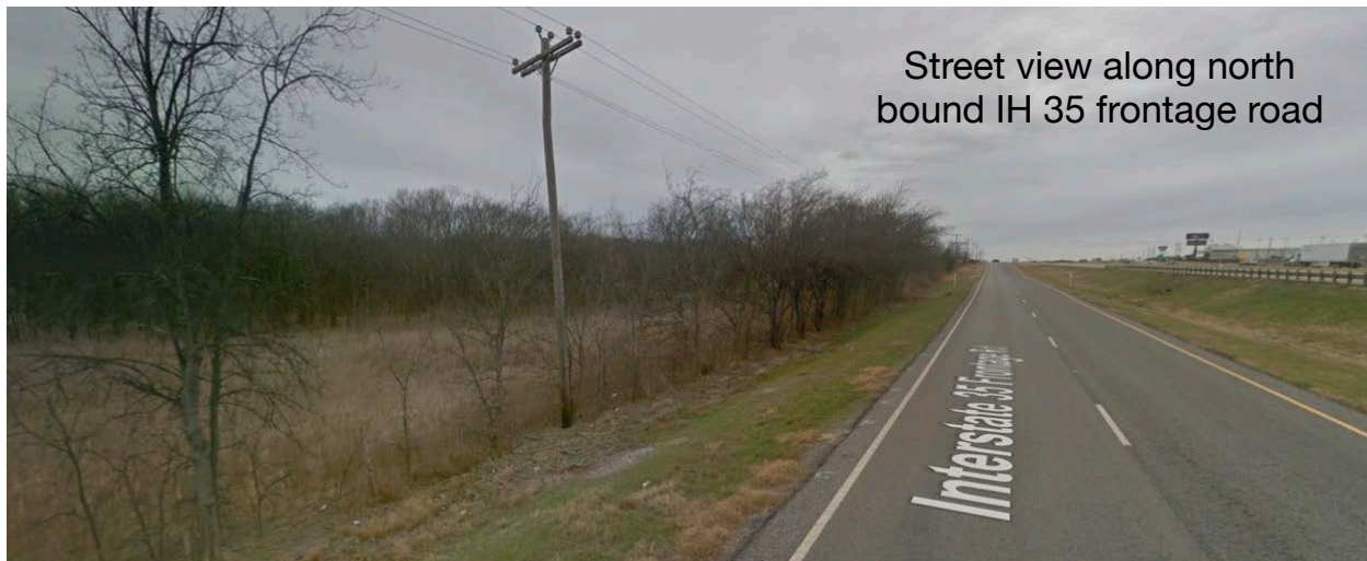
Street view along north bound IH 35 frontage road