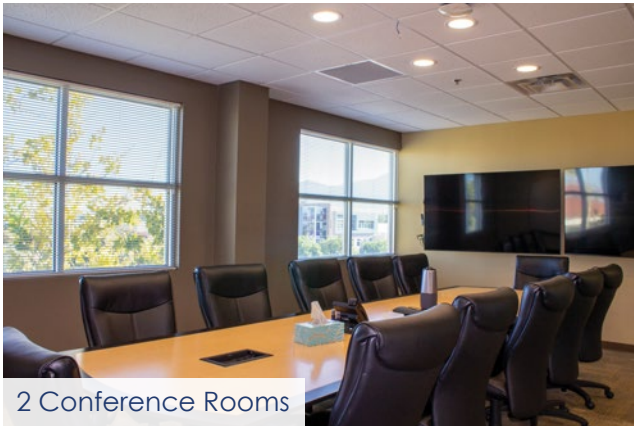
2 Conference Rooms