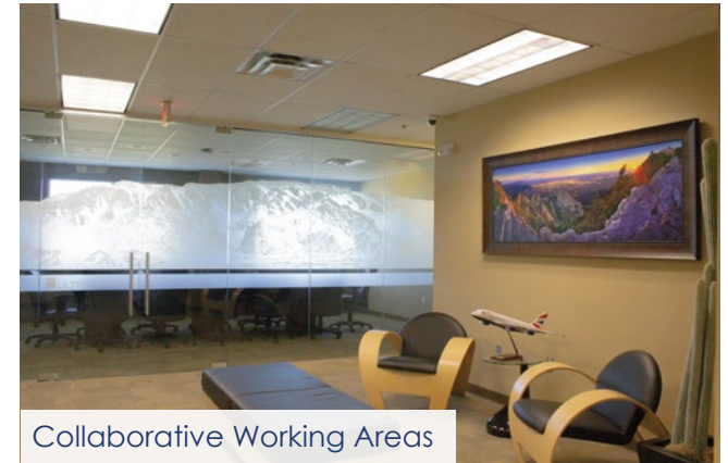
Collaborative Working Areas

FOR LEASE | 8100 LANG AVE NE, ALBUQUERQUE, NM 87109