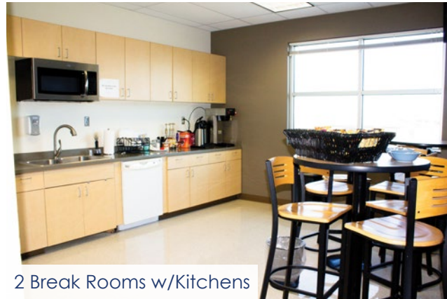
2 Break Rooms w/Kitchens