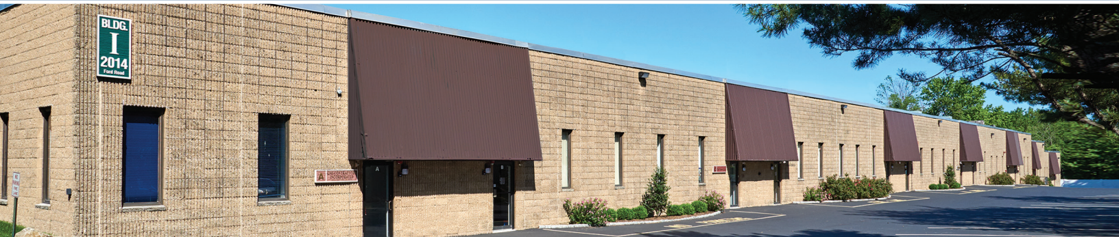
KBC I, 2014 FORD ROAD, BRISTOL TOWNSHIP, BUCKS COUNTY, PA