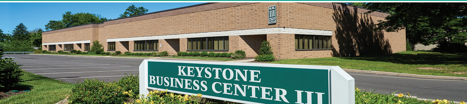
KBC III, 2522 PEARL BUCK ROAD, BRISTOL TOWNSHIP, BUCKS COUNTY, PA

CEILING HEIGHT: KBC I: 16'0" clear under bar joist. KBC II: 19'5" sloping to 18'3" clear under bar joist. KBC III: 19'1" sloping to 17'10" clear under bar joist.