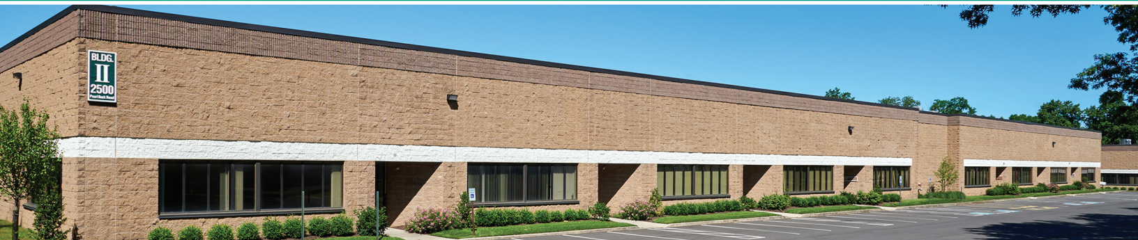
KBC II, 2500 PEARL BUCK ROAD, BRISTOL TOWNSHIP, BUCKS COUNTY, PA