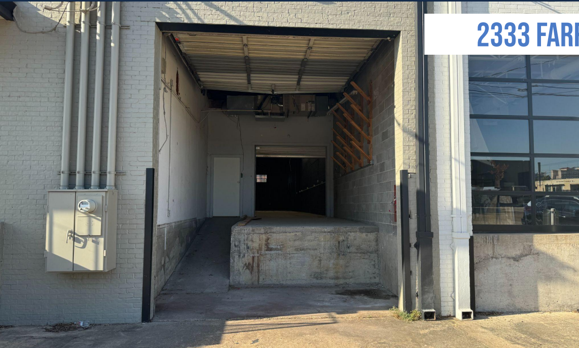
2333 FARRINGTON ST