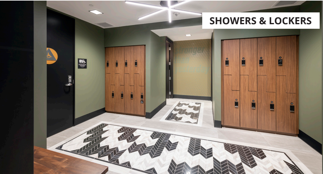
SHOWERS & LOCKERS