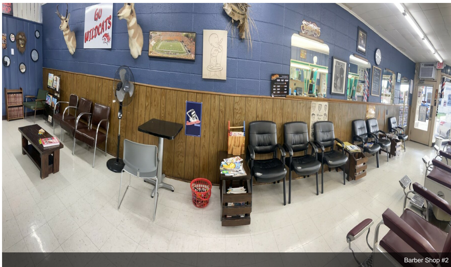
Barber Shop #2