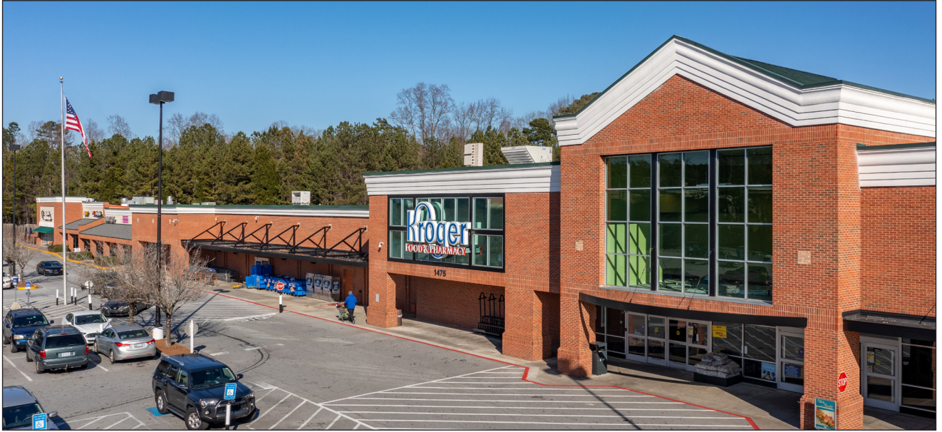
1475 Buford Drive, Lawrenceville, GA 30043