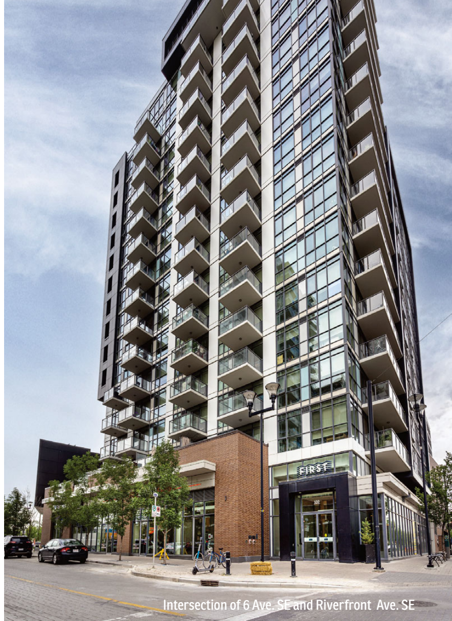
Intersection of 6 Ave. SE and Riverfront Ave. SE