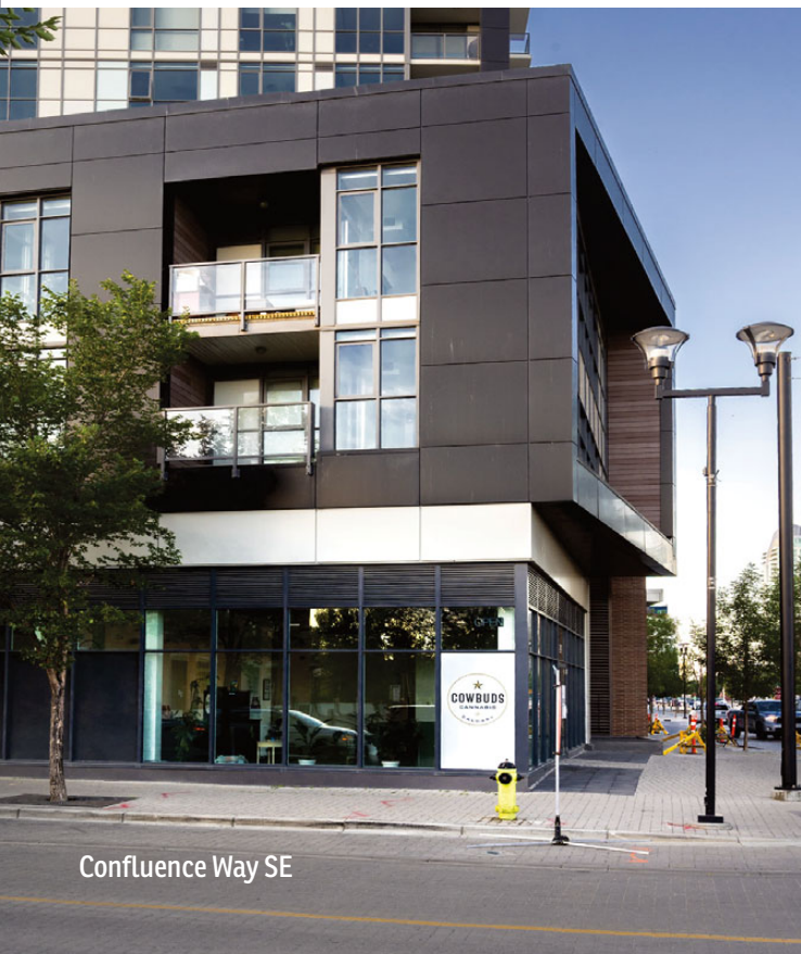
Confluence Way SE