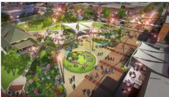
CENTRAL PLAZA CONCEPTUAL RENDERING