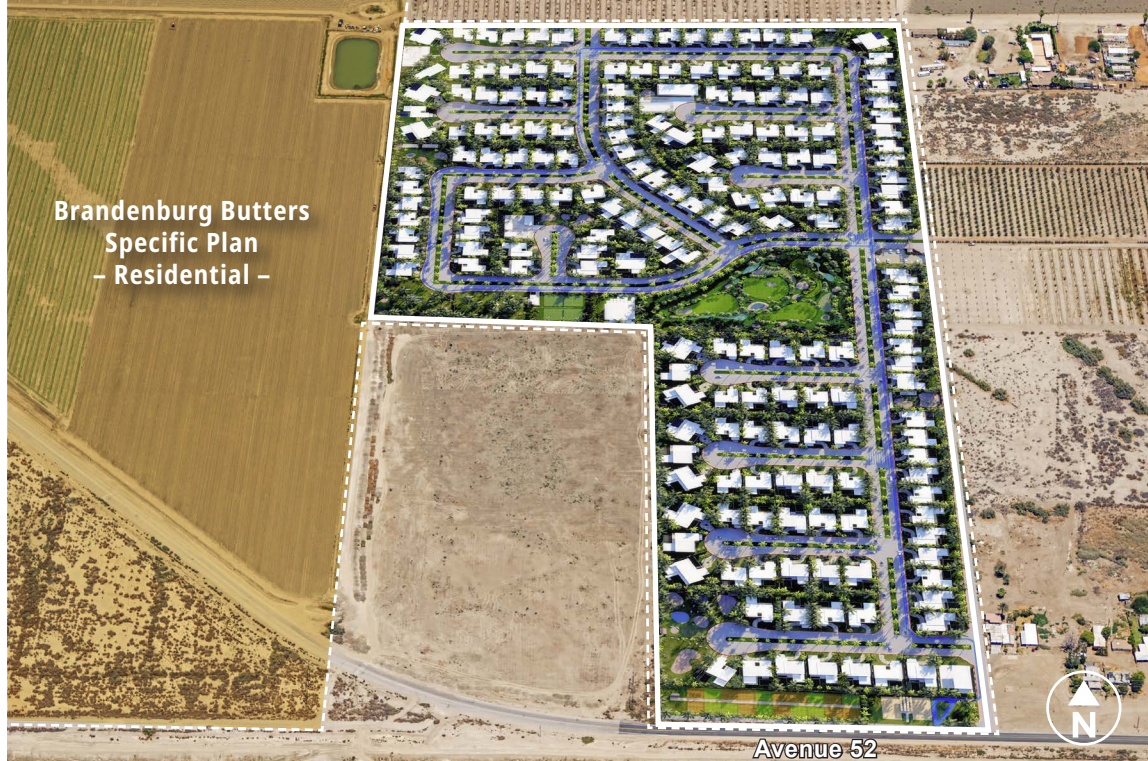
Property Aerial View

COACHELLA 60 ACRES AT AVENUE 52 is located near I-10, and just east of the Hwy. 86 / Avenue 52 exit within the path of development, with uses that include single family residential, short-term rental (per City approval) or long-term rentals (BTR), agriculture, or potentially cannabis cultivation (per City approval). The City of Coachella has some of the best-selling residential projects in the entire Coachella Valley. This property was previously entitled for 206 Residential Tentative Tract Map Lots (7,000 sq. ft. min in size), and can yield up to 212± total lots. This property is also located near Jacqueline Cochran Airport, Thermal Club Race Track, and Coachella Music Festivals.