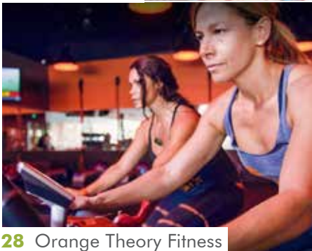
28 Orange Theory Fitness