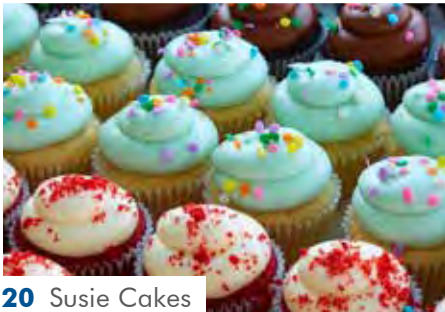
20 Susie Cakes