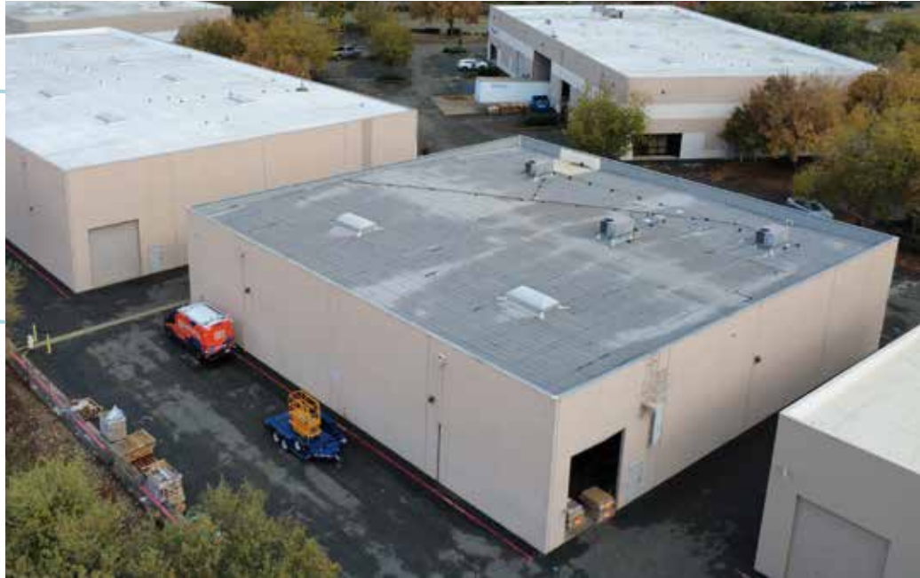
Sunrise Industrial Submarket