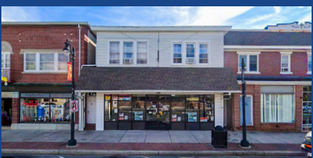
208 PHILADELPHIA AVENUE