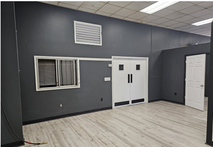
Door from showroom into warehouse