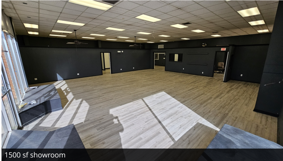
1500 sf showroom

1001 and 1009 Walton Way, Augusta, GA 30901