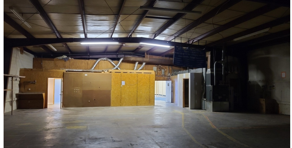
3000 sf warehouse