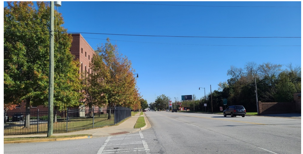
Great location in medical district across from the Judicial Center