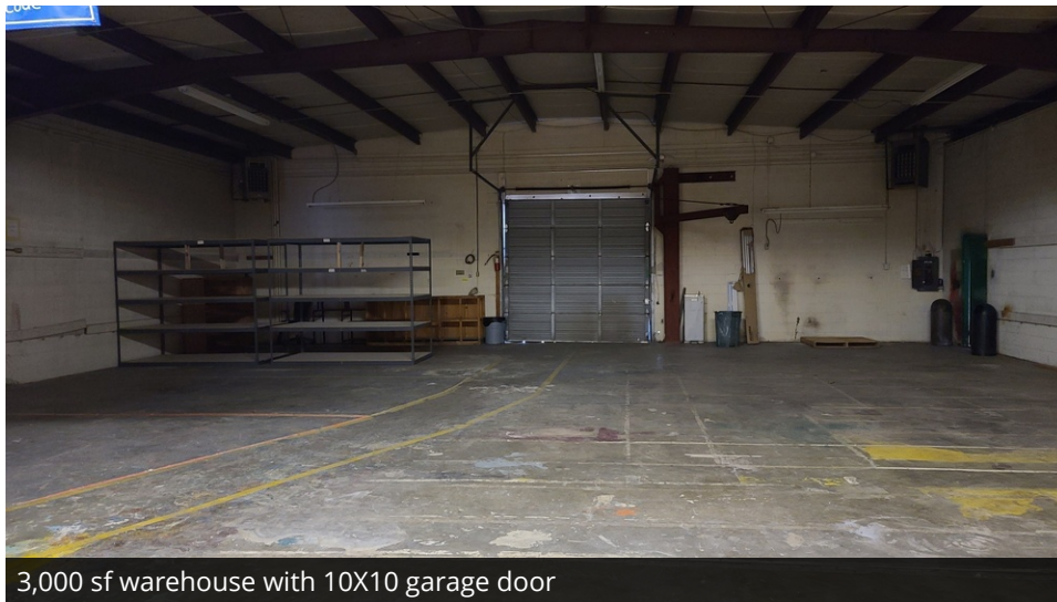
3,000 sf warehouse with 10X10 garage door